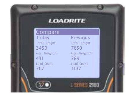
Performance data is stored to allow the operator to compare performance vs. previous, average and best shift