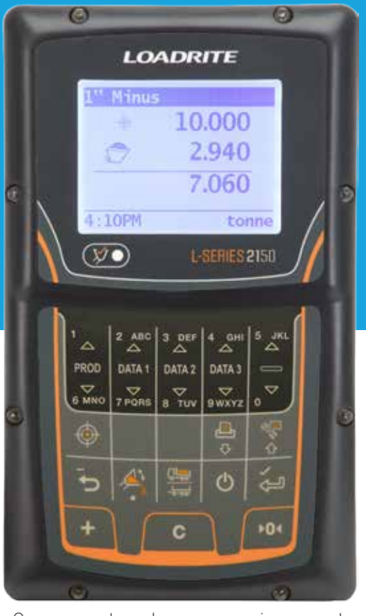
One year parts and one year service warranty.