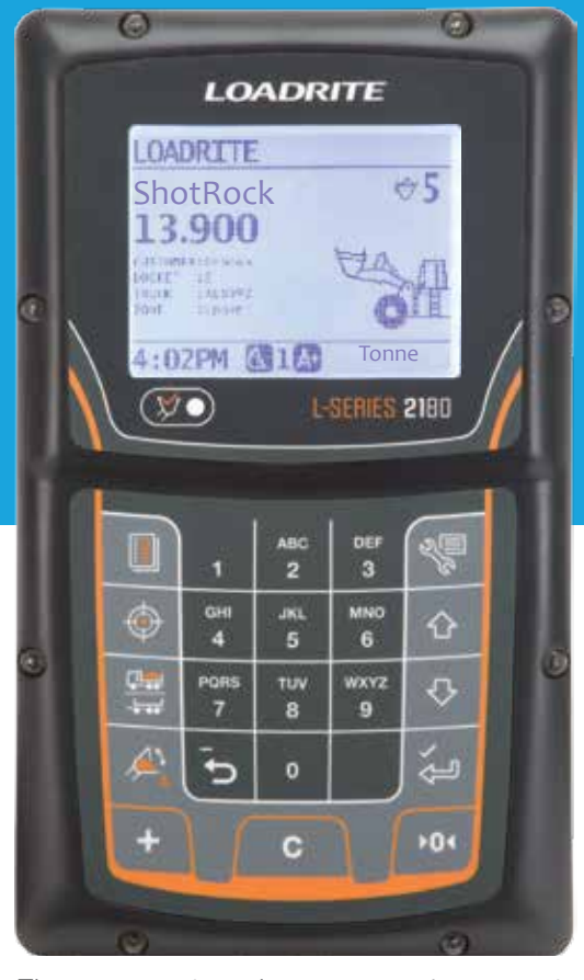
Three year parts and one year service warranty