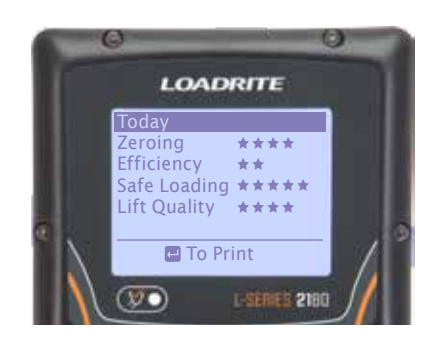
Operators are given a rating to quickly understand performance