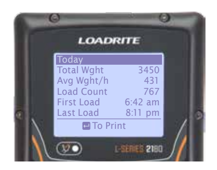
In-cab metrics feedback to the operator during the shift

Trimble introduces a new range of metrics to empower the operator to perform. These metrics help the operator improve accuracy and efficiency each day, compare with personal bests and provide a real-time star rating. Metrics cover loading accuracy, consistency, safety to encourage operators to monitor performance and improve.