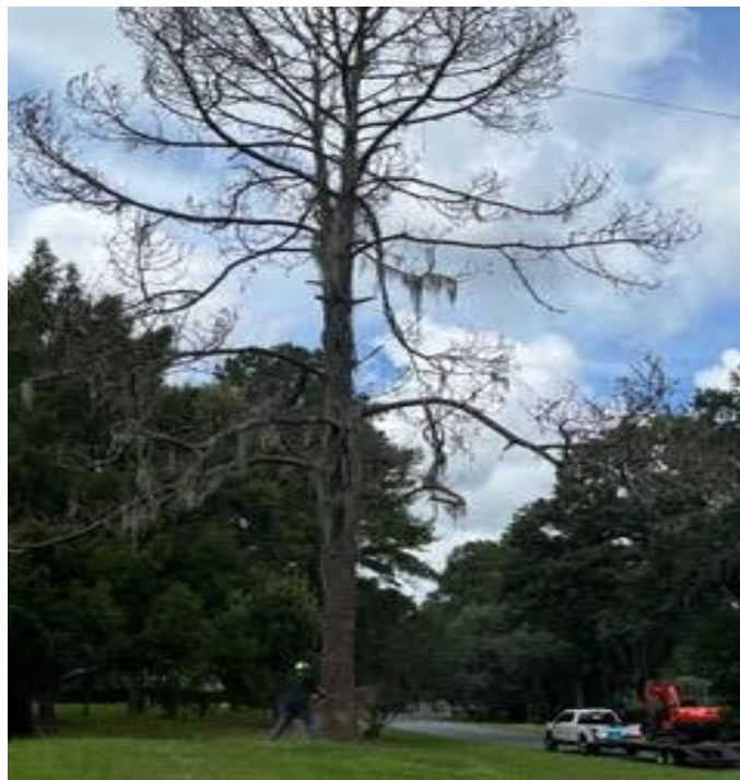
Figure 2 Tree Removal