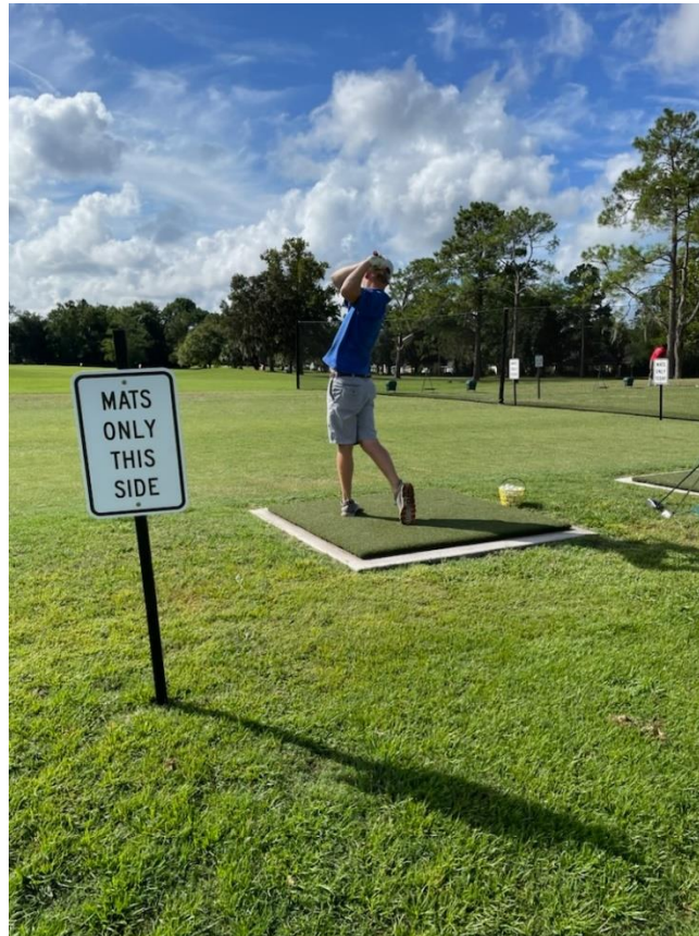
Figure 1 Enhanced Driving Range

Fourteen cement stations with hitting pads have been installed. Seven will be always available with the other half of the hitting area available for golfers who want to practice off the grass. There is a net separating the two areas for safety.