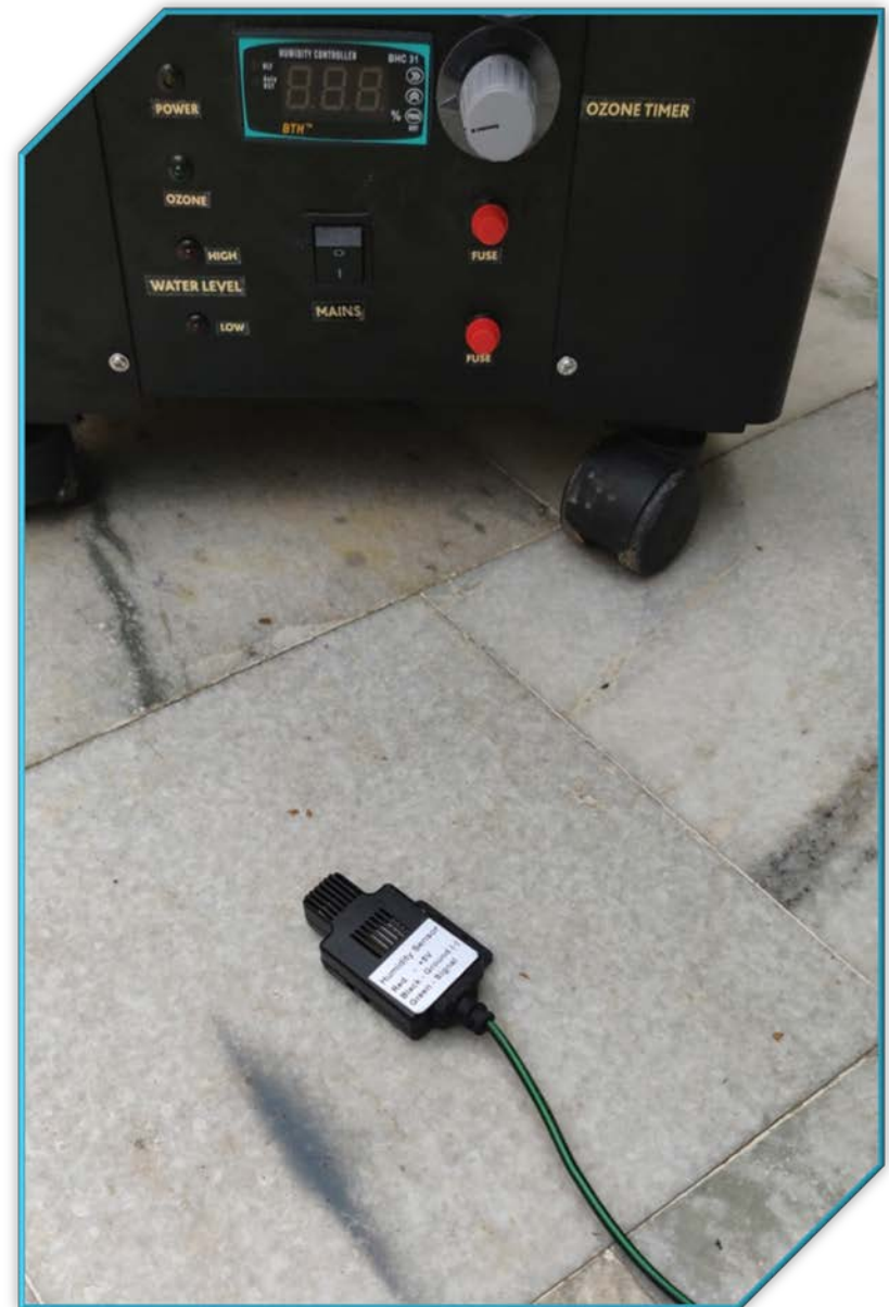
Automatic Cut Off System

Walls / Roof/ Windows Sanitization in Closed Spaces