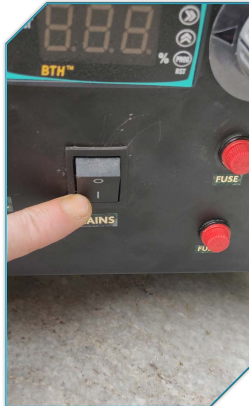
Single Switch Operations

Ozone is 'Generally Recognized as Safe' Cat III sterilization system [USFDA-21 CFR 178.1010 (b) (16/3/1977)]