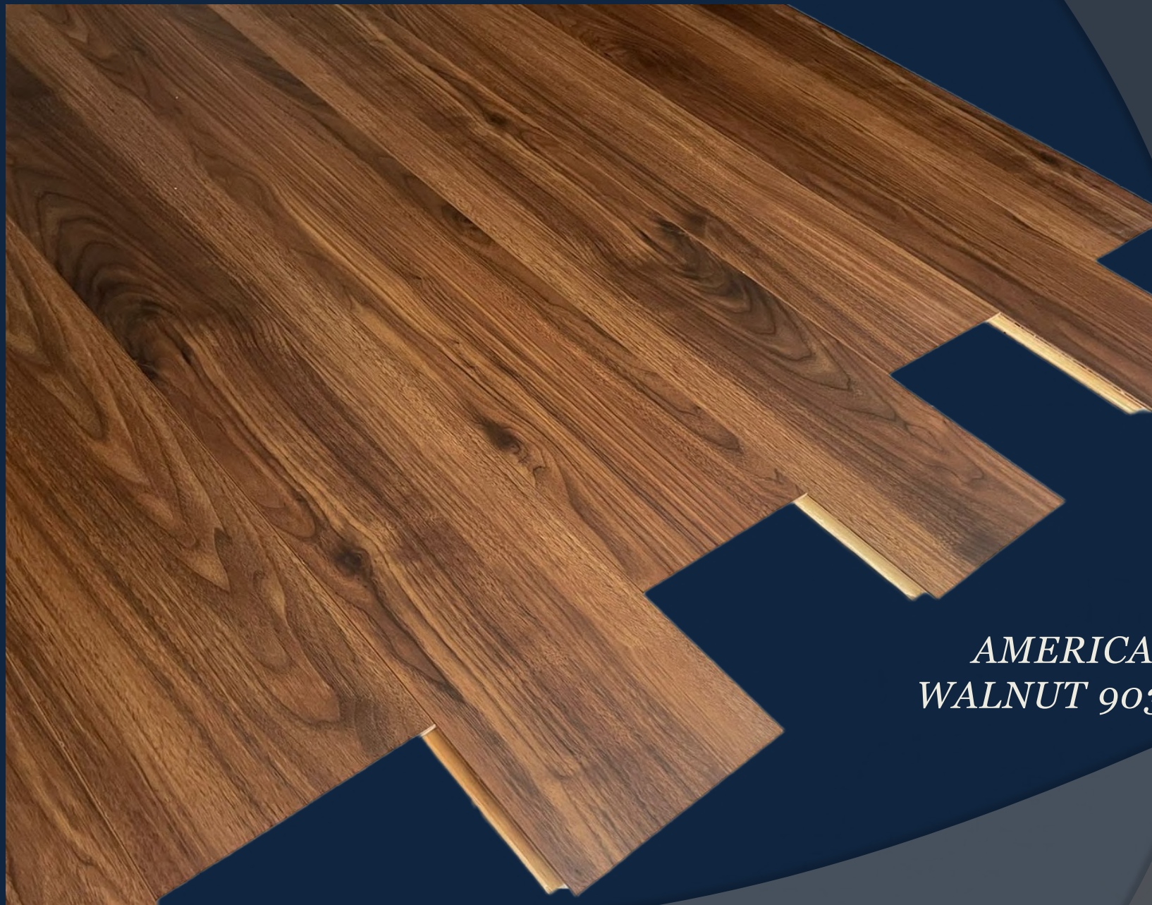
AMERICAN WALNUT 9031