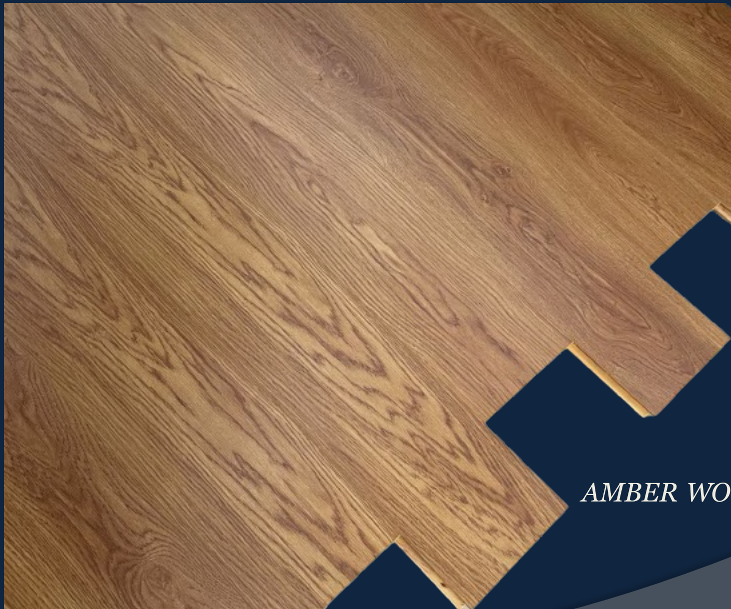
AMBER WOOD 9028