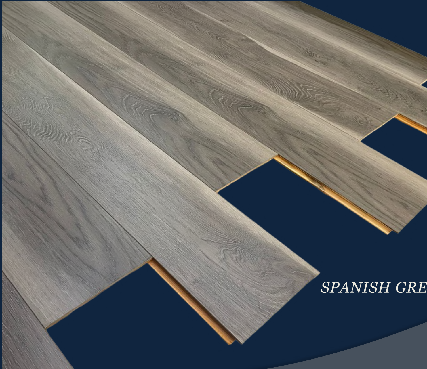
SPANISH GREY 9029