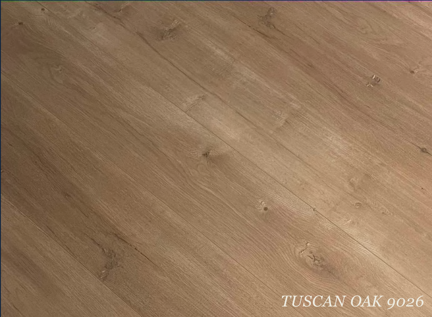
TUSCAN OAK 9026