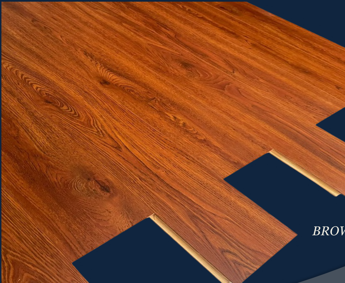
CASTLE BROWN 9027