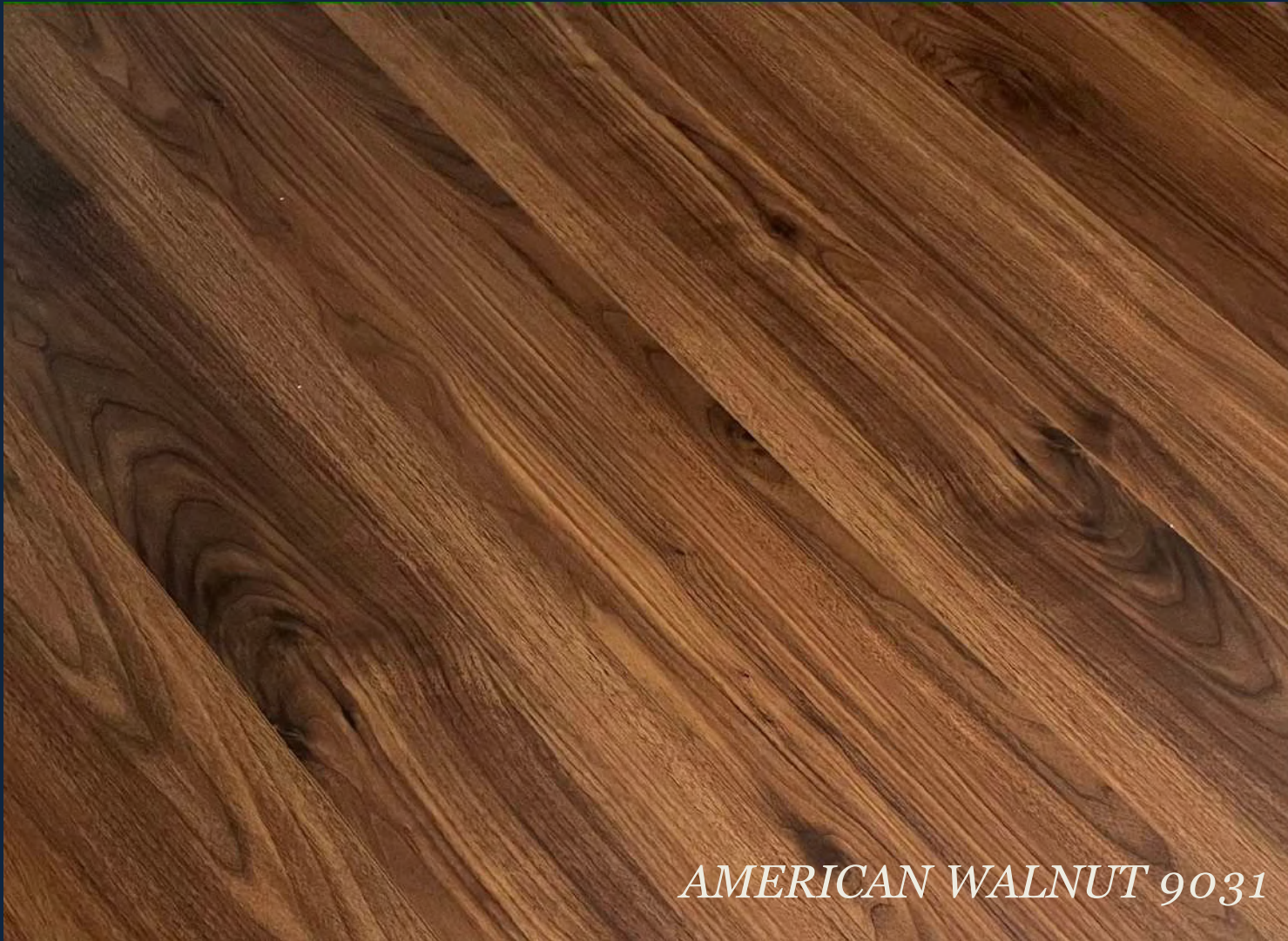
AMERICAN WALNUT 9031