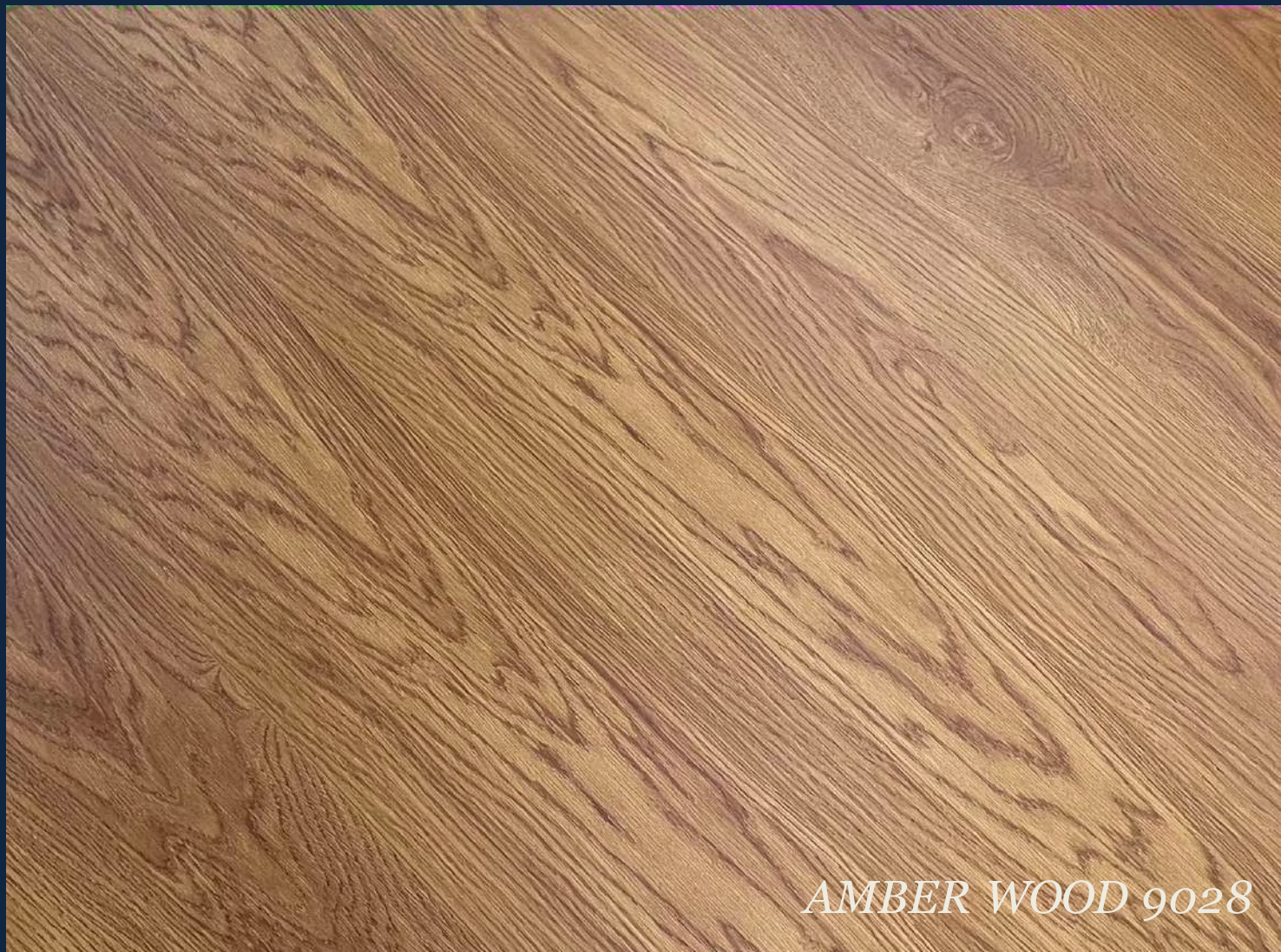
AMBER WOOD 9028