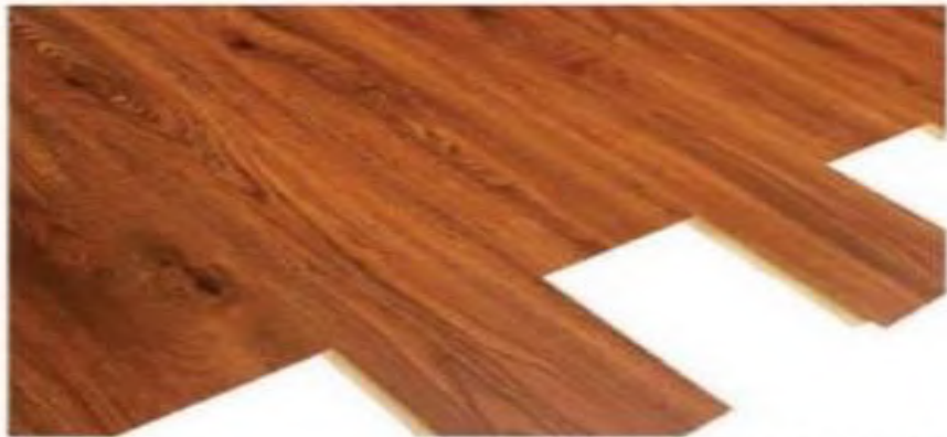
CASTLE BROWN - 9027