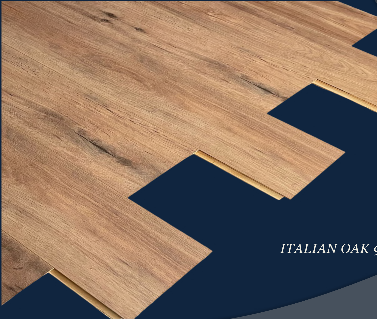
ITALIAN OAK 9030