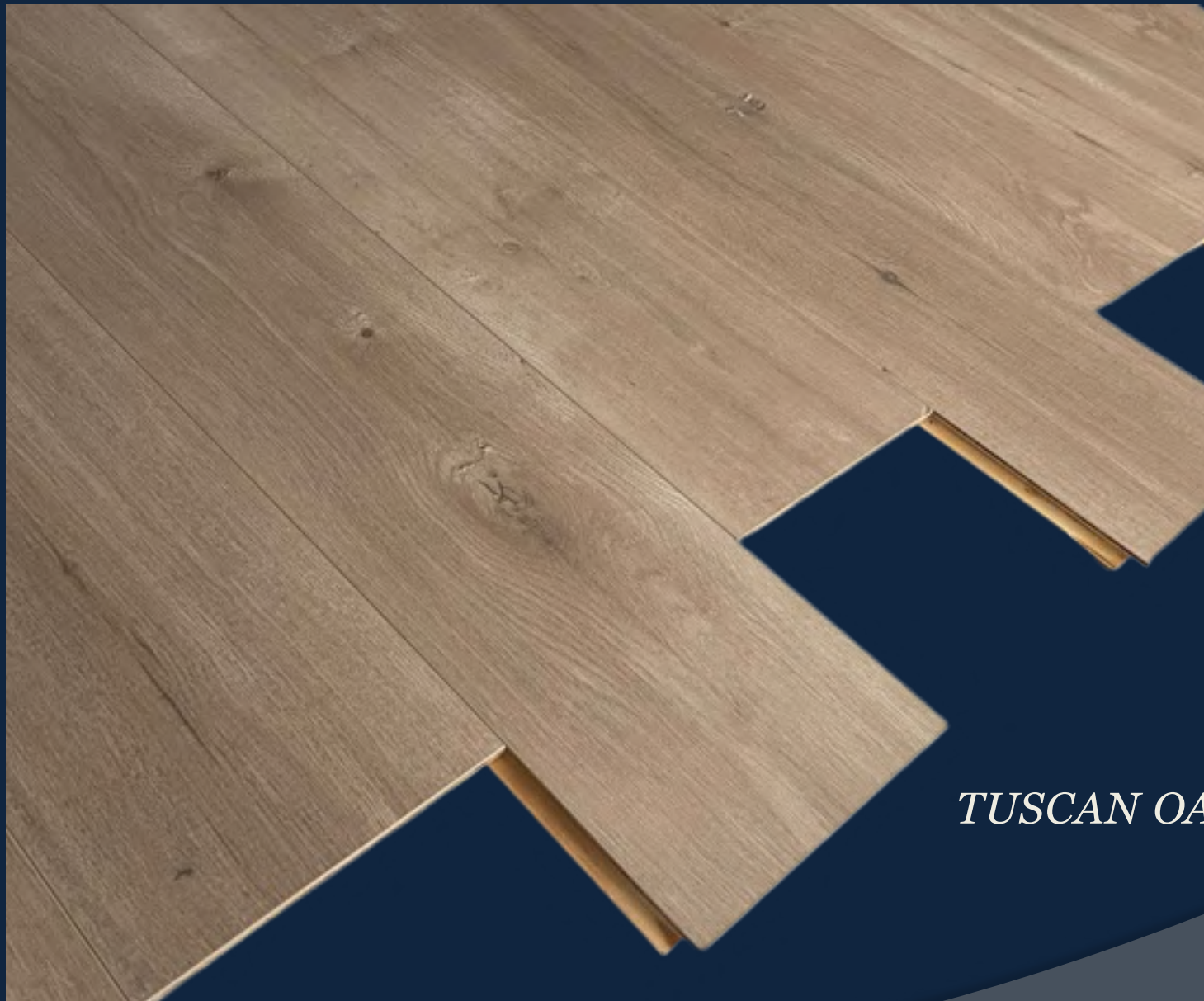
TUSCAN OAK 9026