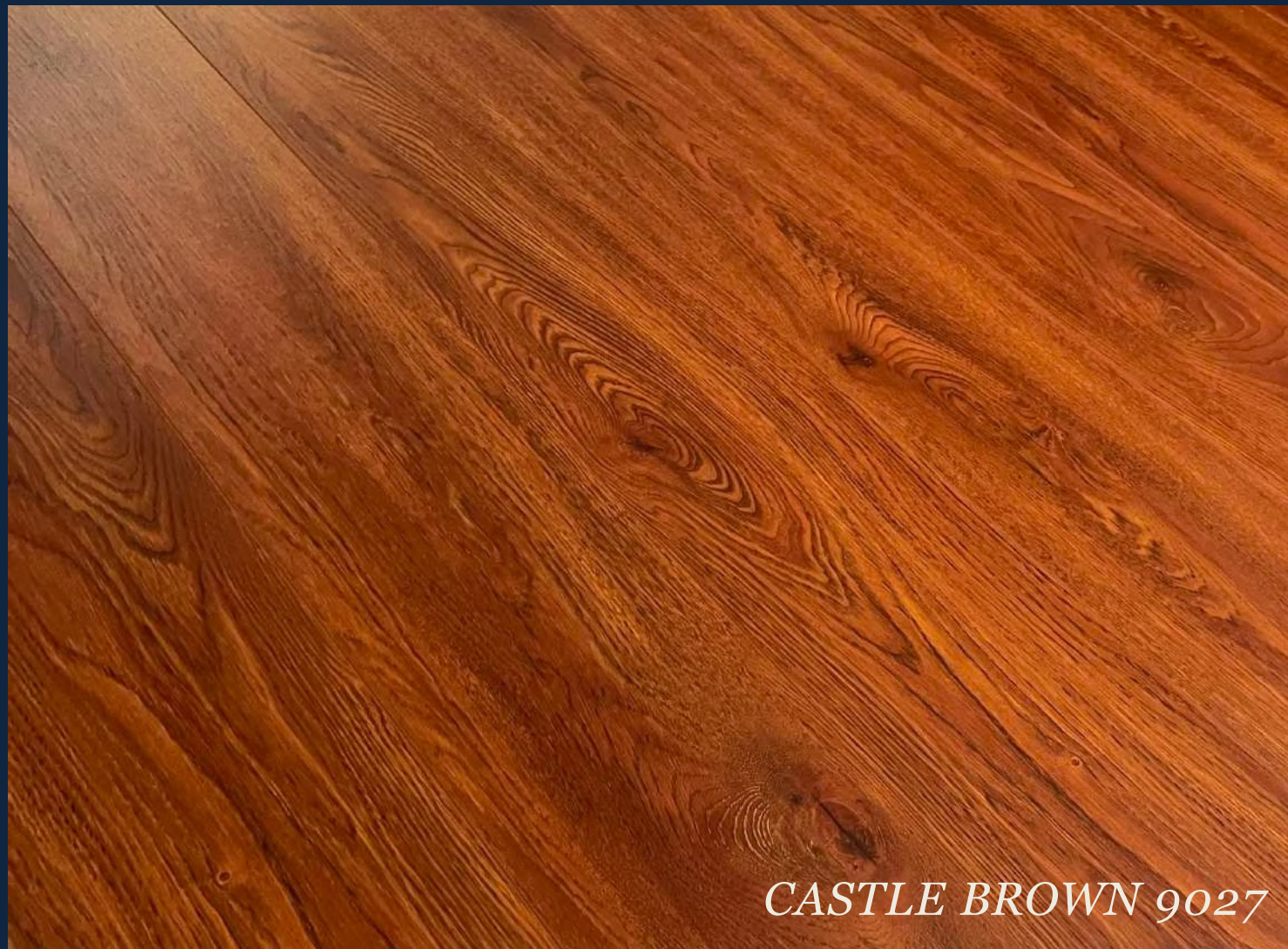
CASTLE BROWN 9027