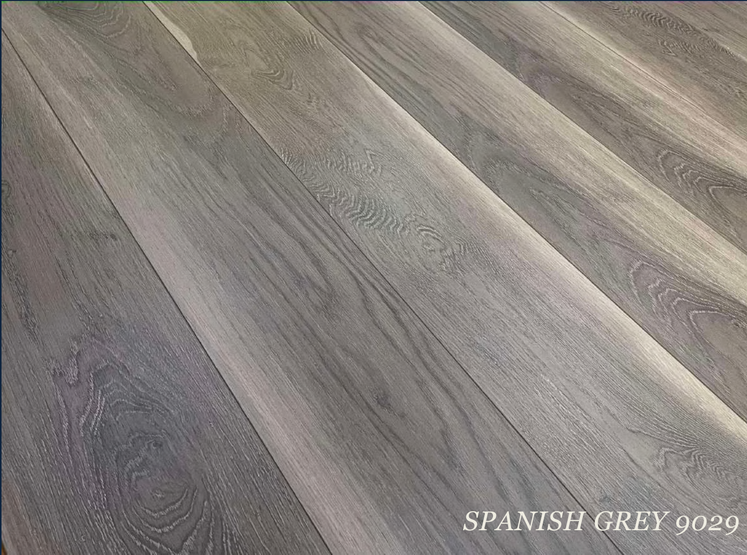
SPANISH GREY 9029