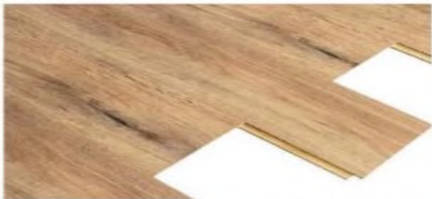
ITALIAN OAK - 9030