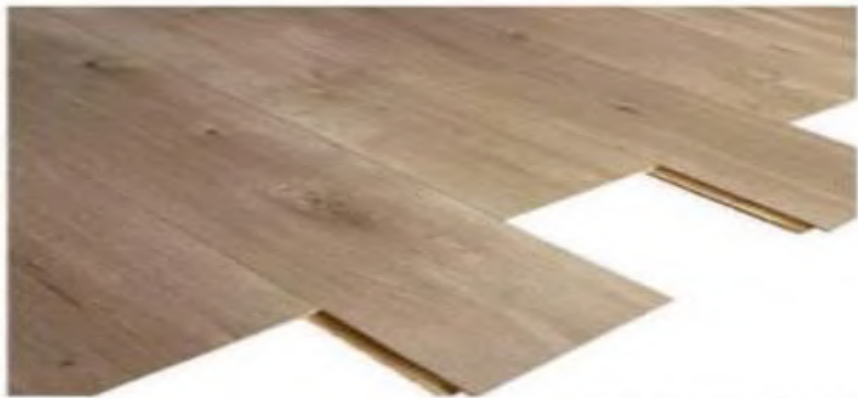
TUSCAN OAK - 9026