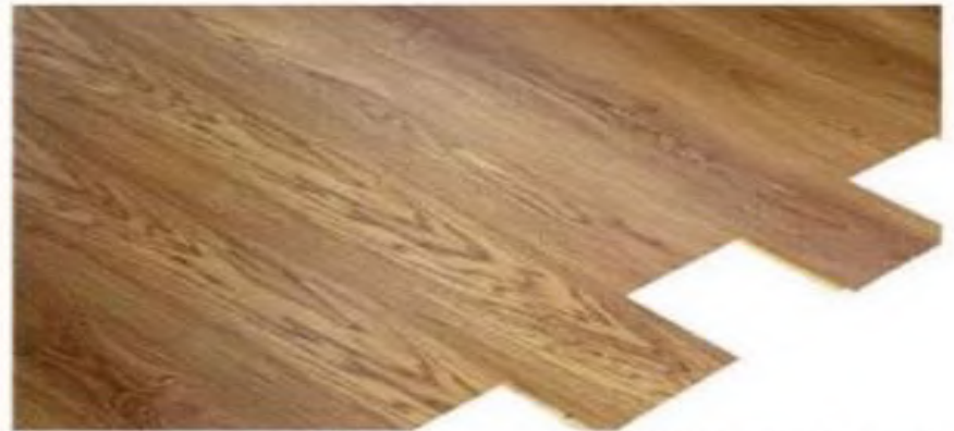
AMBER WOOD - 9028