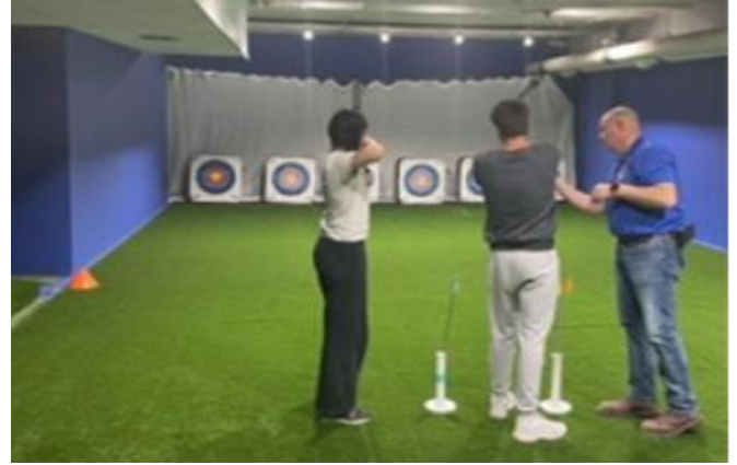
Students receive instruction on the archery range.

diminished over the years, leaving the rifle range space underutilized.