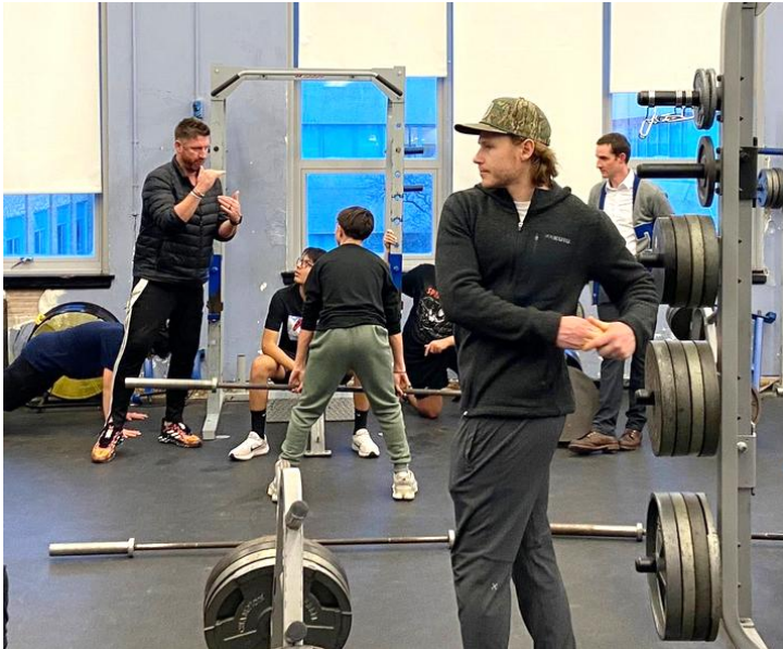
Taft recently welcomed 2016 Taft alumnus and current MLB player Jack Suwinski of the Pittsburgh Pirates for a Strength & Conditioning visit.