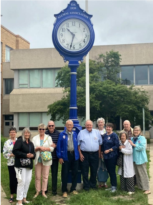
Members of the Class of 1959 rock around the clock.