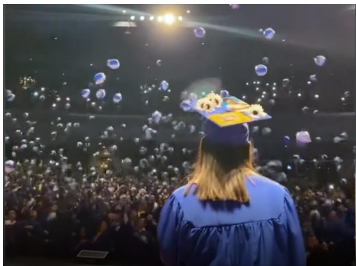
The joyous moment of graduation.

Commencement festivities for more than 800 graduates took place on Sunday, June 12 at the Rosemont Theater. Graduates received four tickets for family and friends.