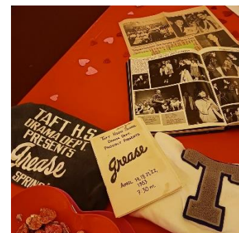
These are memorabilia from the 1983 production at Taft, the first high school production authorized after "Grease" closed its first run on Broadway.

While film producer Alan Carr shifted the setting to California for the 1978 film, adding several new songs and character changes, the popularity of the film has kept new stage productions going for many years. This is the film's 45th anniversary; there was a "Grease 2" sequel at the California school setting.