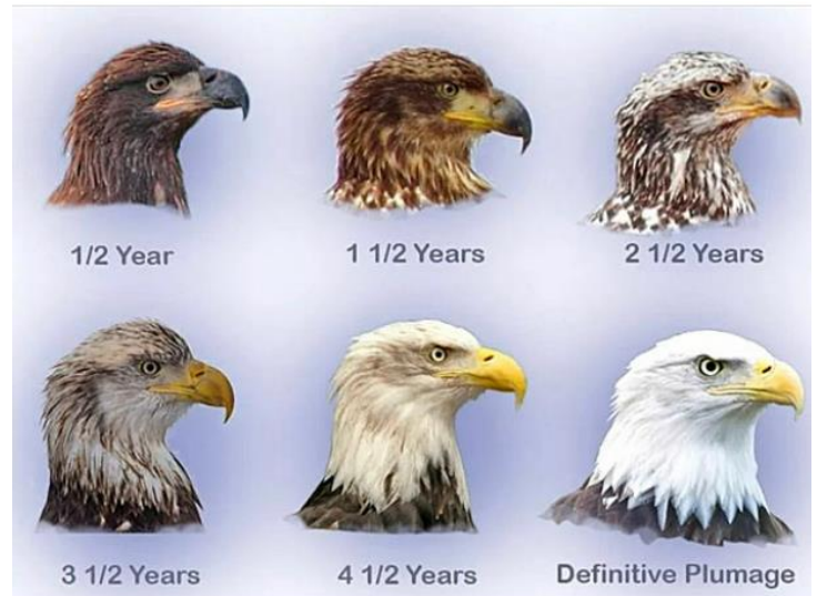
Bald Eagle appearance as it matures.

A Bald Eagle's growth is not unlike that of a Taft student, from the fledgling's grades of 7 and 8 through the senior year. Scheduled to graduate on Sunday, May 28, 2023, are 978 Taft seniors, fully fledged Eagles ready to spread their wings.