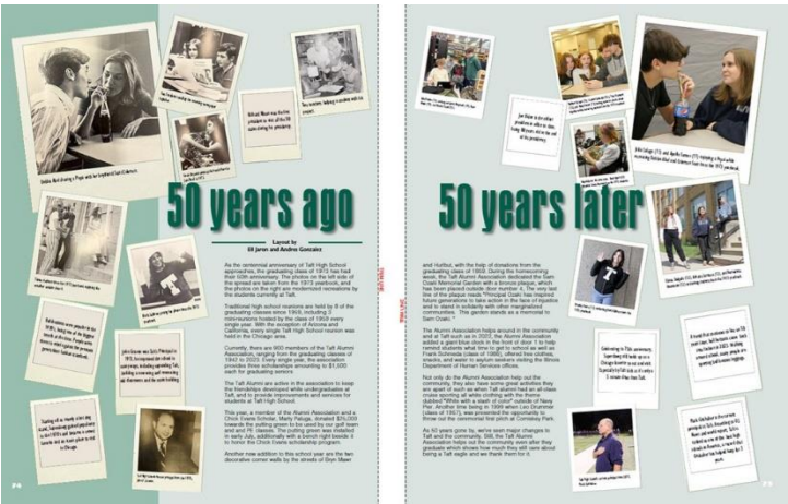
For the very first time, TAA has been featured in the Aerie yearbook. The 2024 yearbook committee cleverly compared student life 50 years ago with today showing the similarities between the class of 2023 and 1973.