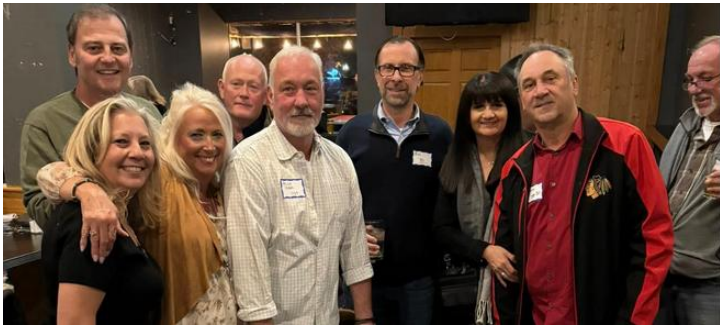
November's annual all-class affair at Moretti's saw great attendance and great smiles.