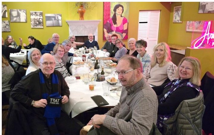
Leading up to the 60th reunion of the Class of January 1965 some of the classmates gathered for dinner and a mini-reunion at the Metropolis Theatre, Arlington Heights to hear "Close to You," a tribute to the Carpenters / Karen Carpenter.

Thank you for the reminder; I renewed my membership using the online portal. Coincidentally, the reminder arrived on a day that I had the occasion to drive about an hour with 3 people with whom I had only brief prior contact. During our conversation, I was asked where I was from, originally. When I replied that I was born and reared in Chicago, I was immediately asked "Which suburb?" It reminded me that, for most of my career, new colleagues and collaborators always assumed that I was not really from Chicago. I even had an attorney in the County Attorney's office make an assertion that I was not really from Chicago and that I was from a suburb, as if I did not know where I had lived throughout my childhood. These episodes, distributed across my career, caused me to think about the assumptions that are made about Chicago and Chicago Public Schools, and how those assumptions could influence how contemporary Taft graduates could have experiences similar to mine. I always respond with a full-throated defense of my K-12 education and my early life experiences. I wonder, if there is some way to prepare current Taft students and recent alumni for dealing with such potentially discriminatory assumptions. Anyway, thanks for keeping the Taft Alumni Newsletter going.