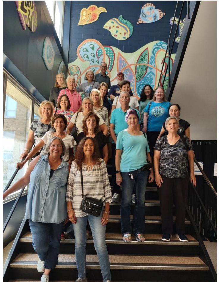
1974 Classmates gather on a stairway during a tour of the Taft campus.