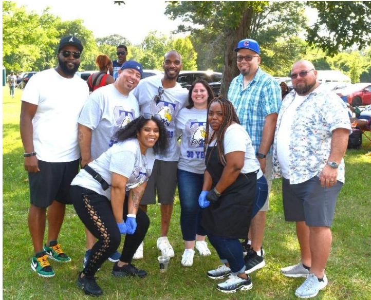
Members of the Class of 1994 celebrated 30 years since graduation.