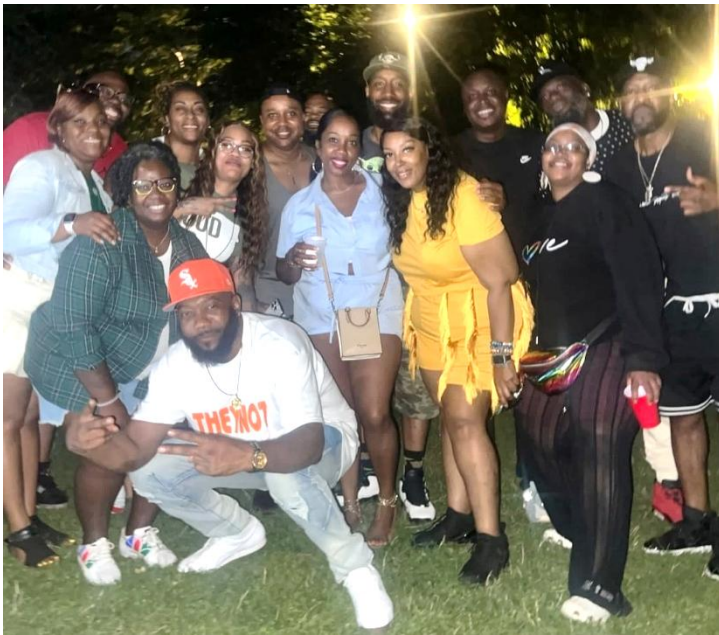
1999 classmates, plus a few "older" folks from the 80s, gathered for an outing at Montrose Harbor in September.