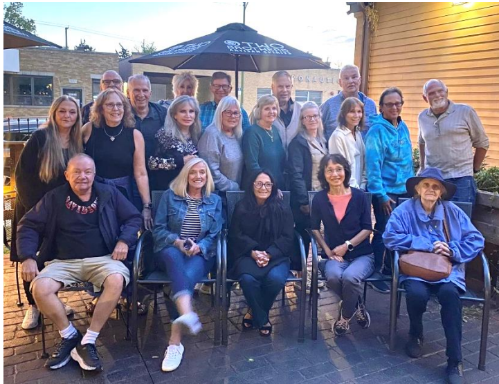
1971 Classmates wound up the summer on September 6 at the Highway House on Northwest Hwy in Chicago, just a stone's throw from Taft.