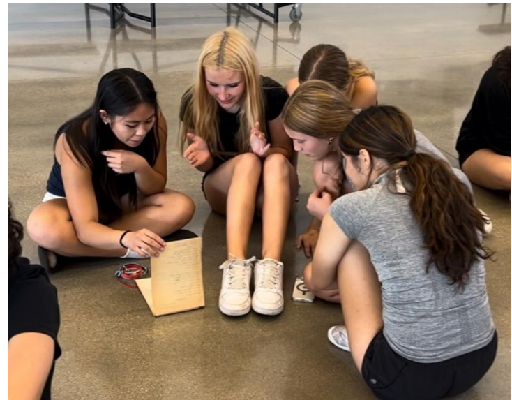
A few of the young ladies discuss cheers of old.