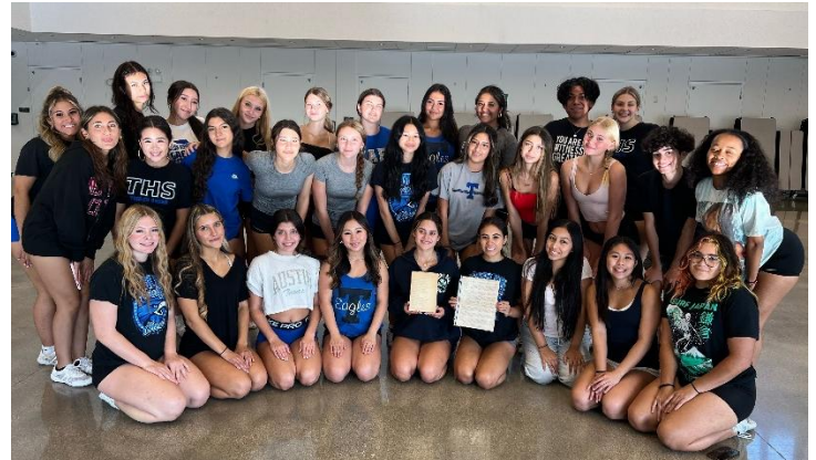
Thirty of the more than forty Taft cheer team members gather to display the notebook and cheerleader contract.