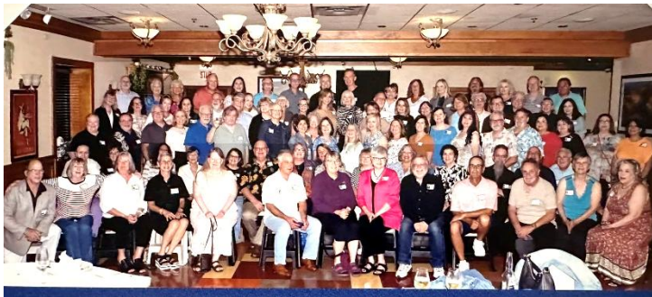
A great turnout for the Class of 1974 at Moretti's in Edison Park.