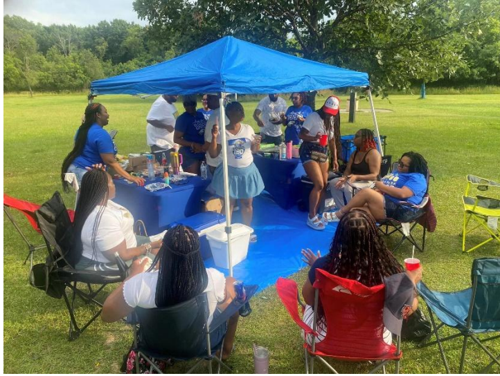
One of the many tents at this annual gathering of eagles in the Schiller Woods Forest Preserve, full of music, food, and camaraderie.