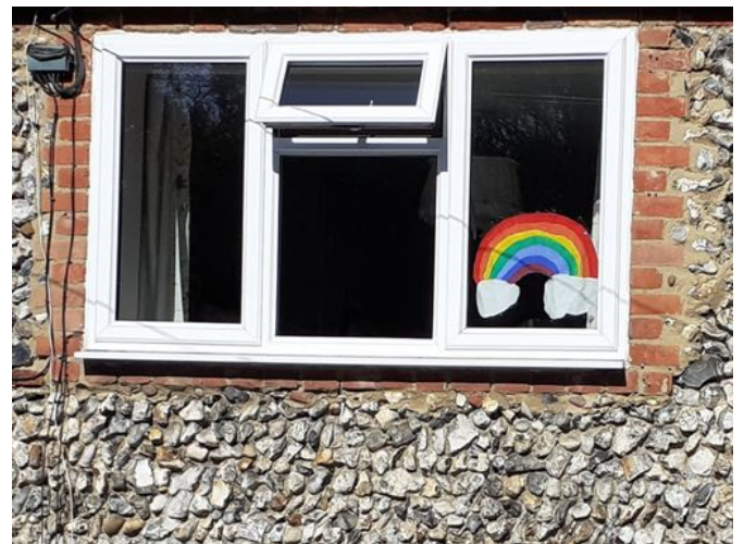
Teddies and rainbows in windows