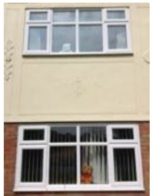
Teddies in the windows