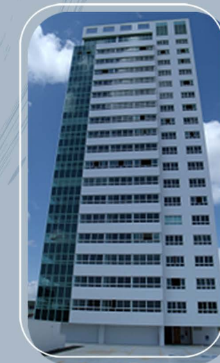
business center THEMIS TOWER