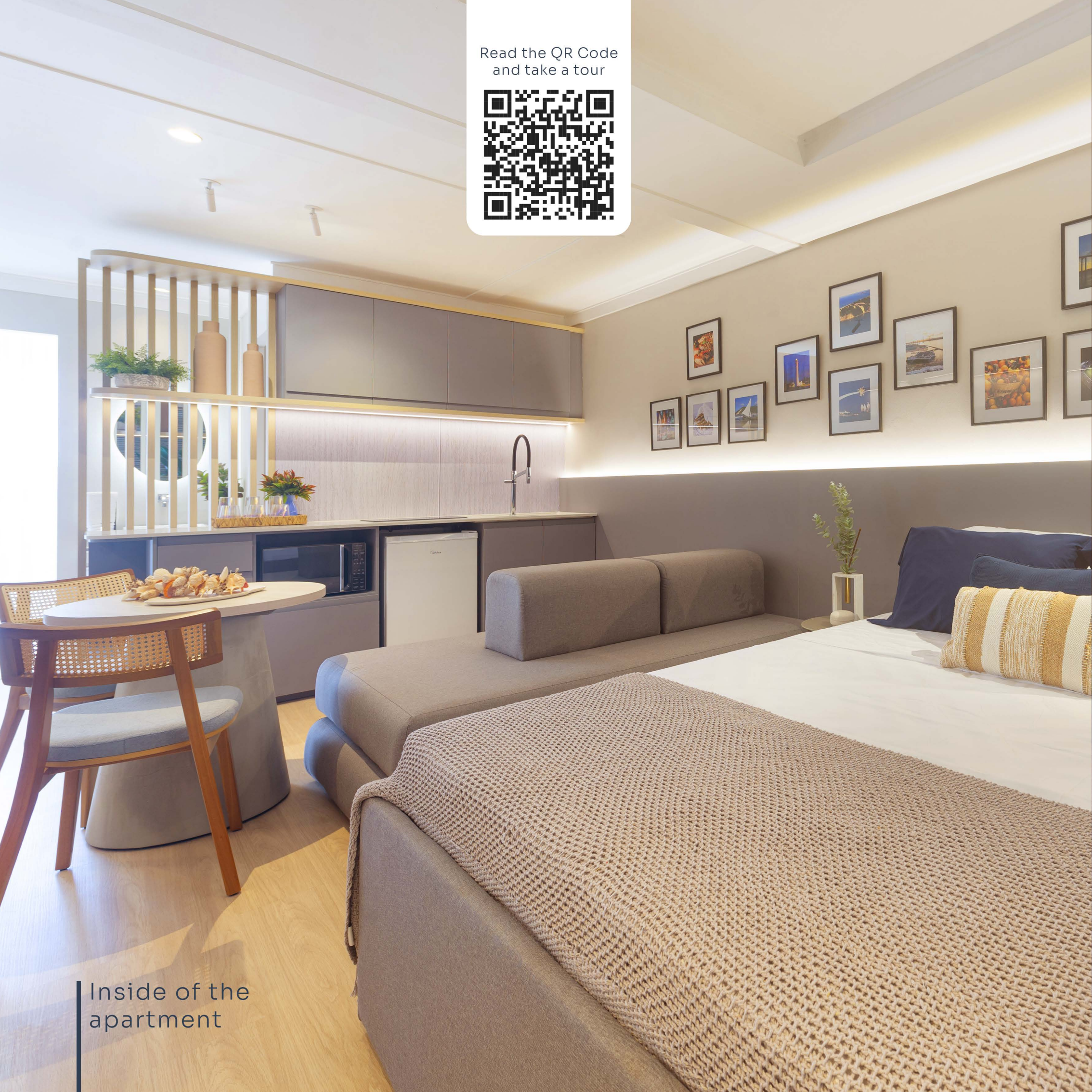
Inside of the apartment