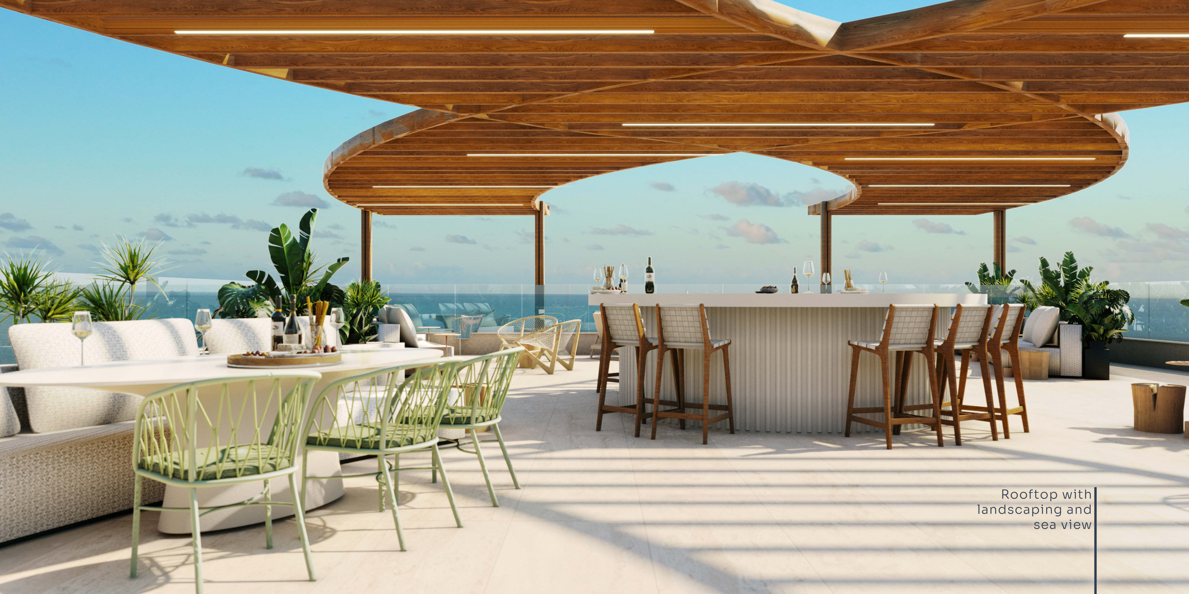
Rooftop with landscaping and sea view