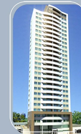
residential BOSQUE TIROL