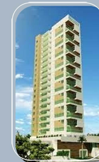
residential TERRAÇO DAS DUNAS