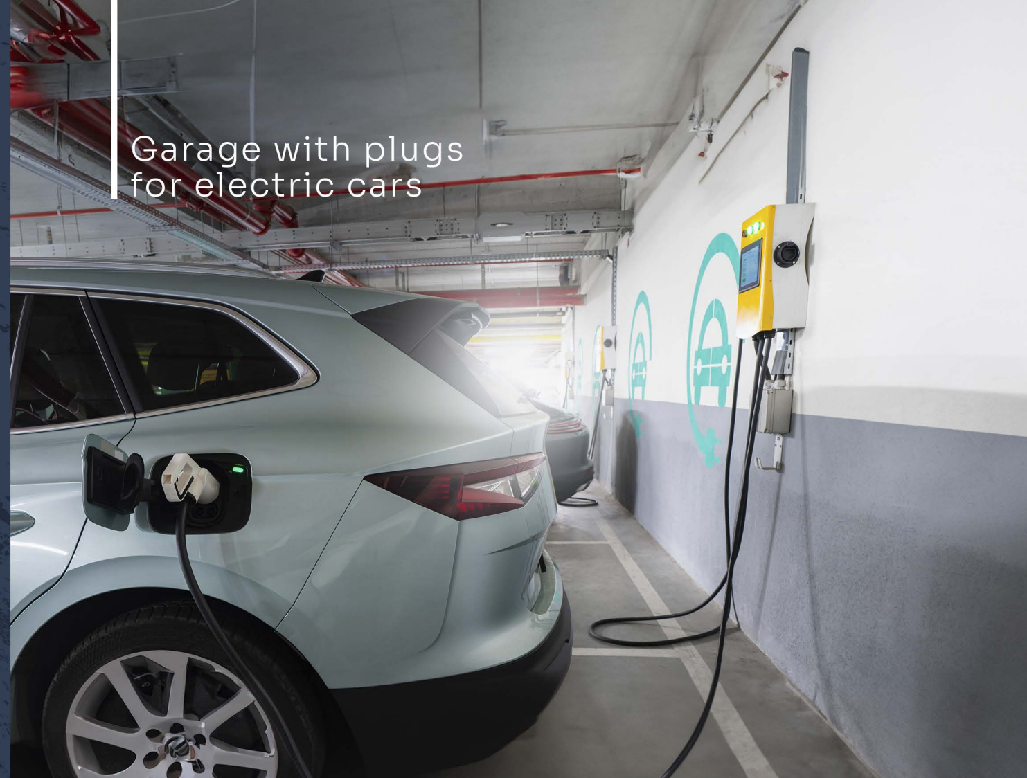
Garage with plugs for electric cars