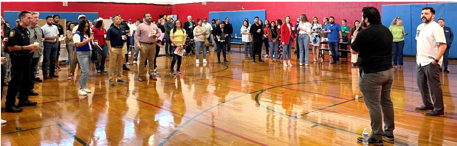
The Fort Worth Hispanic Chamber of Commerce drew a crowd Oct. 27 at the Northside Boys & Girls Club, 2000 Ellis Ave. Check for future "Coffee with the Chamber" networking events online .