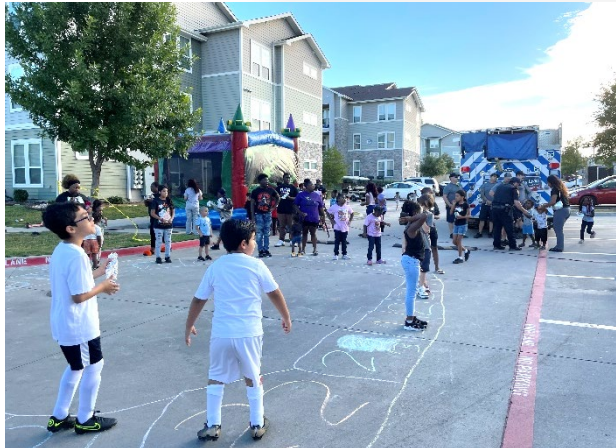
Children at Alton Park Apartments enjoyed an old-fashioned cake walk and seeing a firetruck.

Working together to build a strong community