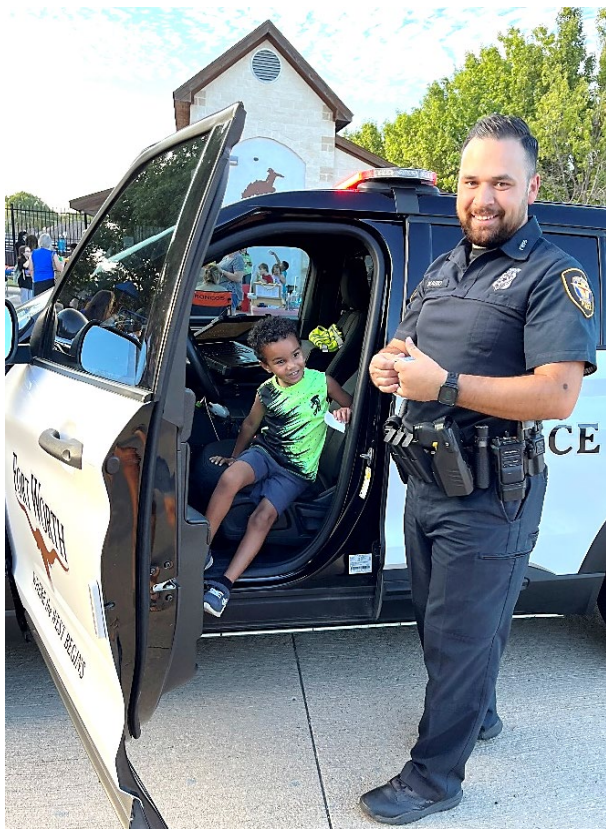
NPO Moreno showed off his patrol car for kids at Remington Point. The HOA also had a petting zoo.