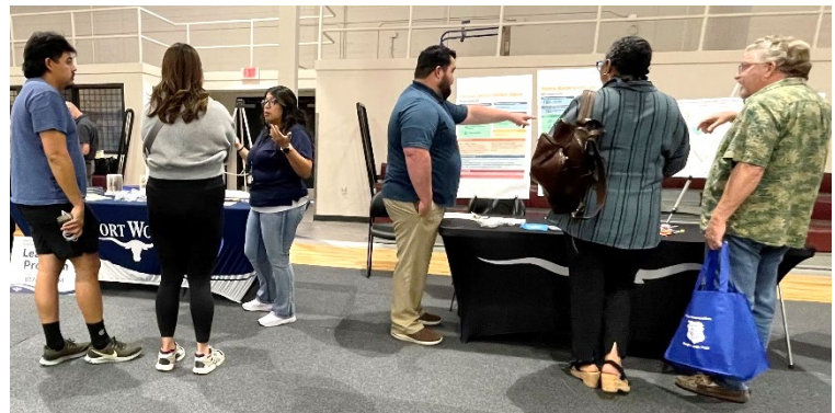
At right: Two tables offered Neighborhood Services program information.