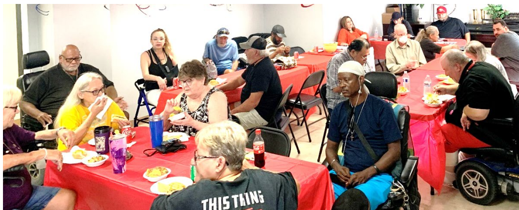
Fair Oaks Apartments residents enjoyed a meal together in the community room.