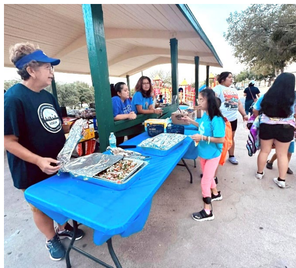
North Side Neighborhood Association teamed up with Northside Community Center for food and fun.