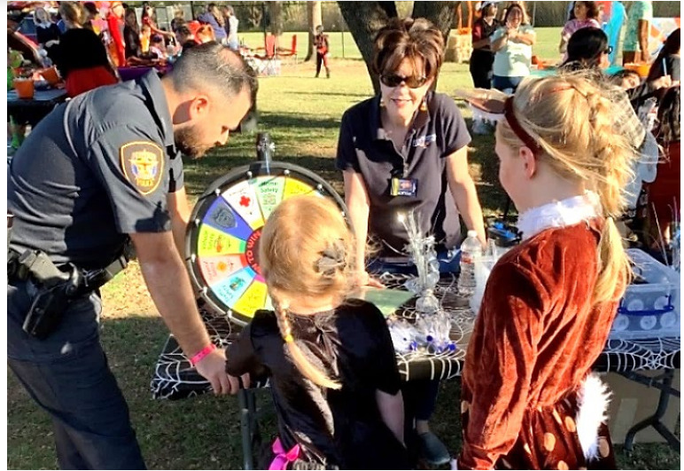
Thanks to Northwest YMCA for inviting us to their Fall Spooktacular Oct. 14. Kids who answered a safety question got to choose a prize.