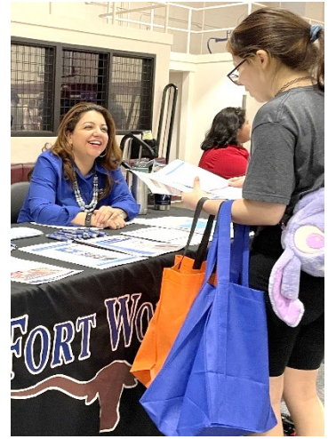
Left to right: A split-screen monitor showed how Real Time Crime Center cameras scan for vehicles and license plates wanted in connection with crimes. FWISD explained educational programs and security measures. Transportation & Public Works had maps of flood-prone areas.