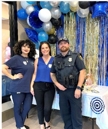
Awesome decorations at Azora Ranch Apartments.