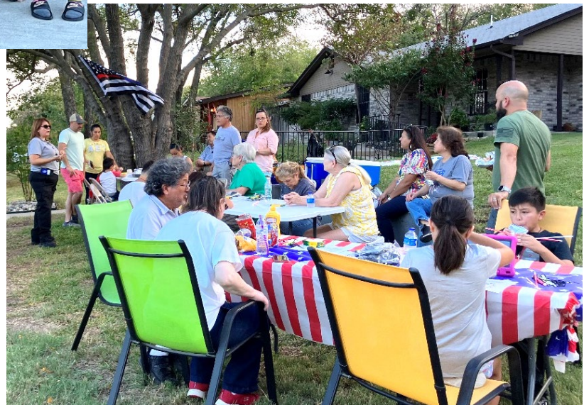
A neighbor's corner front yard was the perfect place to set up the party in North Beverly Hills.