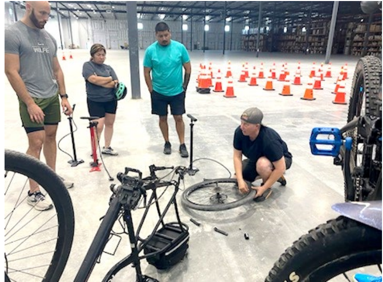
Bike patrol training includes equipment safety checks and how to make repairs.