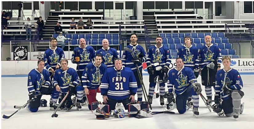
The Panthers Police Hockey Team made it to the United Armed Forces Hockey Classic championship Sept. 2-3, but lost 2-1 to the Arlington Fire Department. An Oct. 14-15 matchup at ICE at the Parks Arlington benefits disabled veterans.