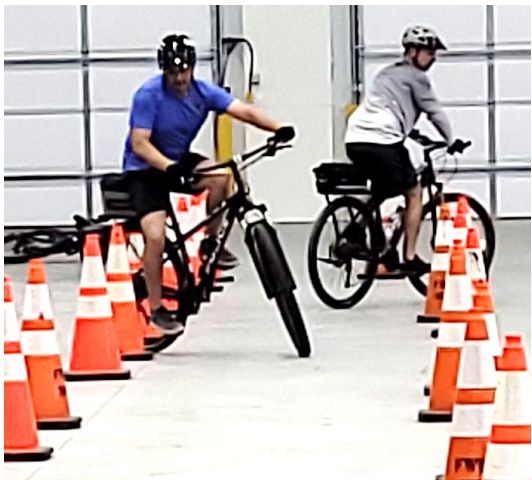
At left, trainees practice maintaining balance at slow speeds. It's harder than it looks!