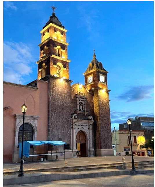
The Church of San Diego de la Unión is a local landmark. Officers say the hourly bell chimes are beautiful but often awakened them at night!