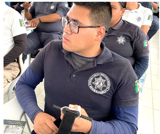
Experts say training local police in Mexico, can help curb violence that may spill across the border into the U.S.