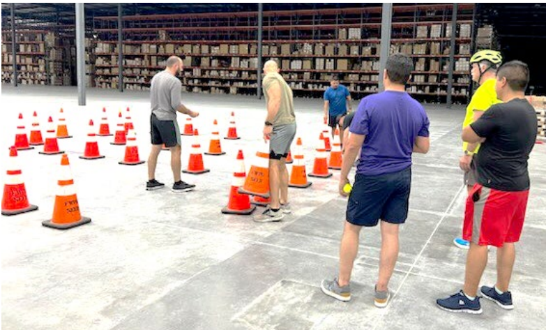
Traffic cones set up in an empty warehouse give bike trainees practice maneuvering in tight spaces.