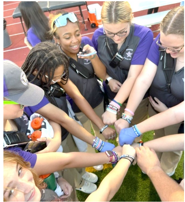
Back the Blue wristbands were a hot item! Officers handed them out to fans as they entered the stadium.