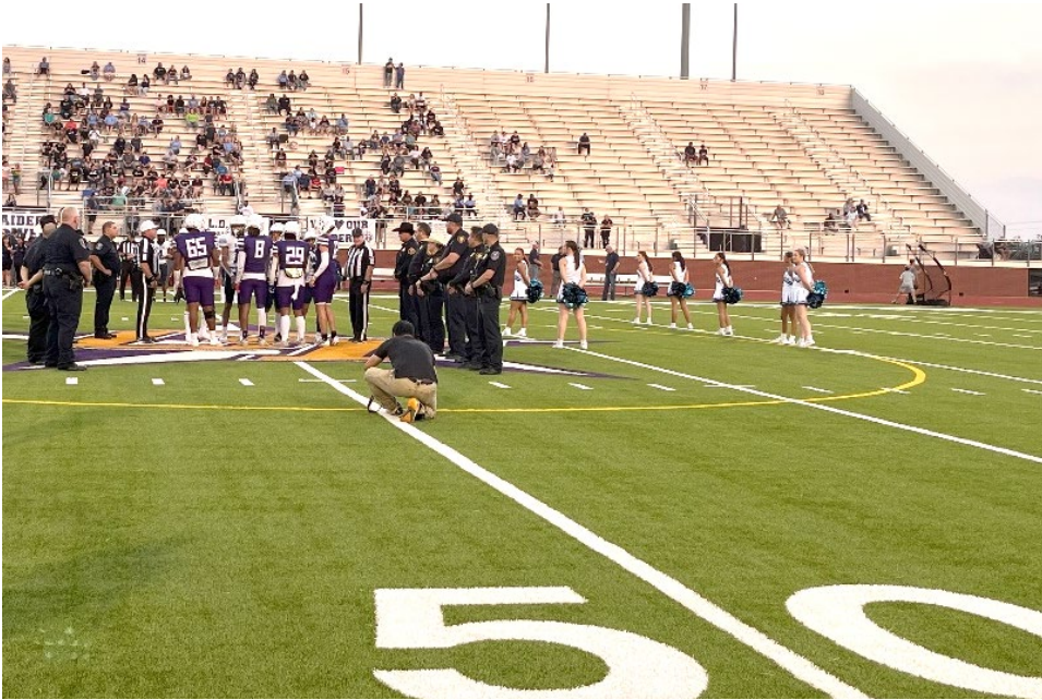
Northwest Division Police were among first responders honored at center field during Chisholm Trail High School's Sept. 15 First Responders Night at Rangers Stadium.