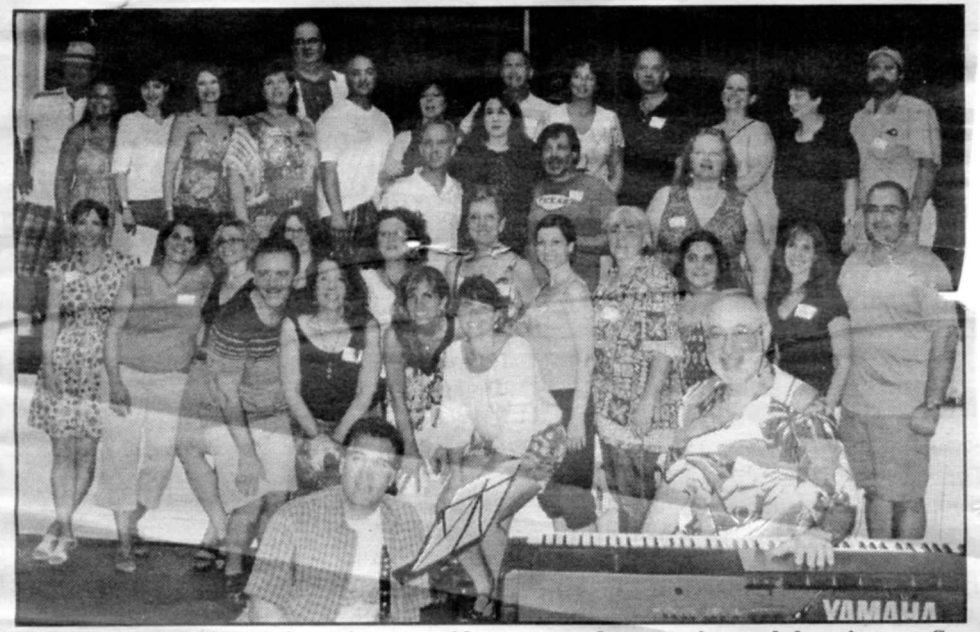
Port Summer Show alumni spans 40 years and a reunion celebration at St. Stephen's Church on Aug. 4 attracted 60 alumni who came from all over the U.S. to celebrate the Port Washington tradition.