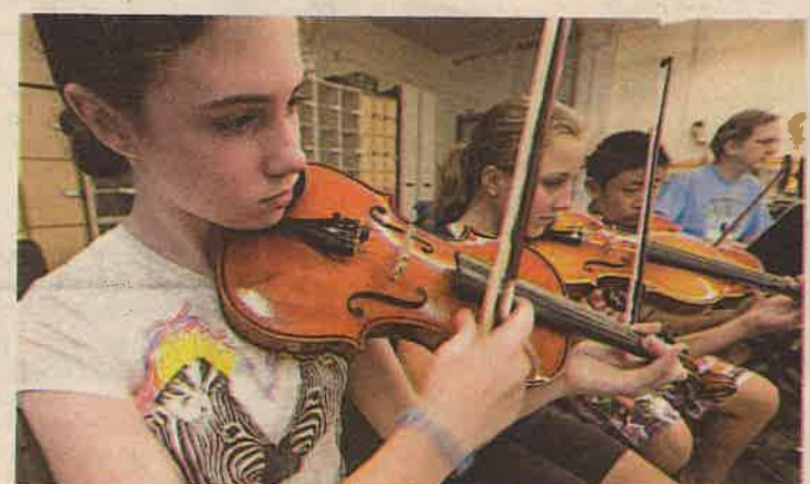
About 30 musicians are playing in the musical. Many students return to perform year after year. A production staff of pros helps.

"Shrek" is a huge production — huge in all aspects. We have the biggest cast we've ever had, over 60 people. Usually it's between 50 and 55. From a physical standpoint, the production demands a lot — there are puppets, there are special effects, there are costumes and makeup that are really out of the ordinary. It's really raising the bar."