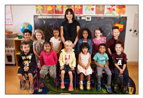
INTERNATIONAL SCHOOL FOR PEACE