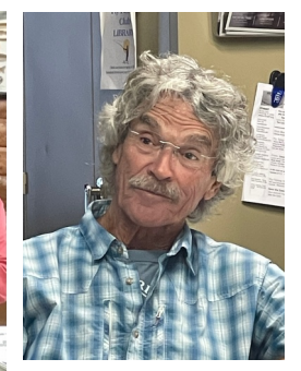
Baz, Thanks again!