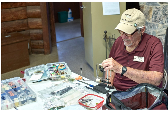
June Fly Tying