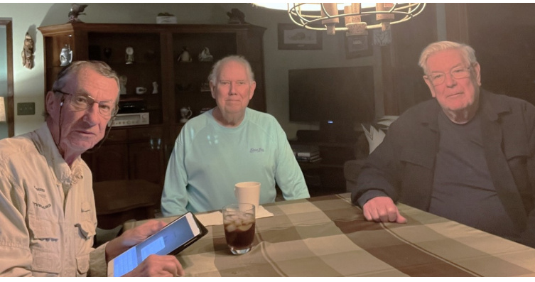
or you could watch from home or wherever you are (in Arkansas)