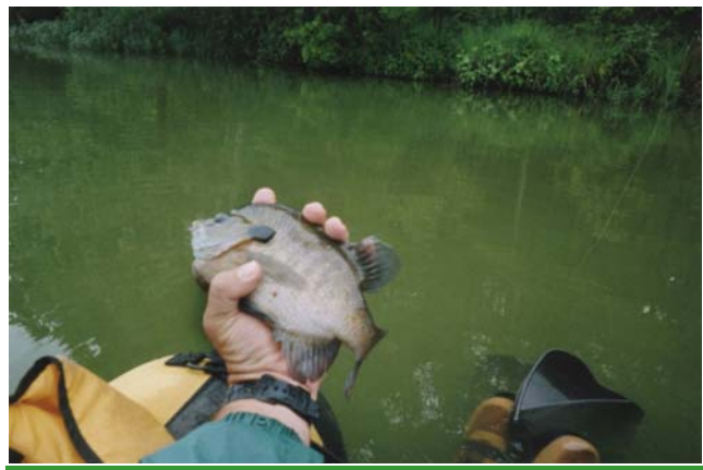
Editor's Note: This is not the Monster, just one of the average ones! Terry's picture of the big one didn't turn out good enough for reproducing here. Ask him to show you the photo.

But while most of the participants sat around talking about fishing, I decided to do some fishing. Callaway Gardens usually charges a fee of $185 for a half day fishing with a guide, but for this event, they would take a group of five fishermen, or lady as we had one in our group, for forty bucks. For this low fee you got a float