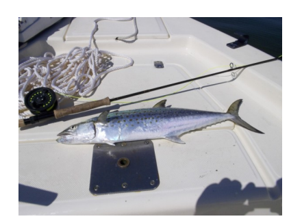
From Tom Finkle....Another huge Spanish Taken and released near Gulf Breeze