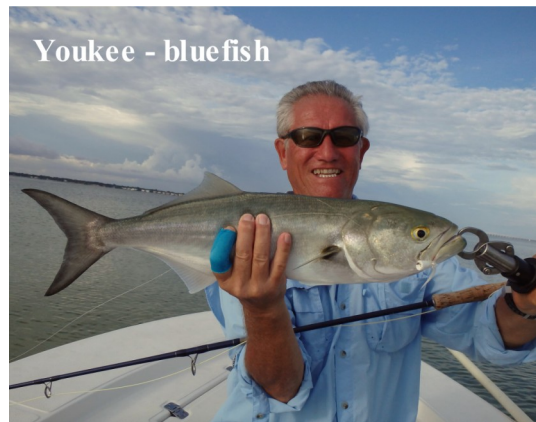
Youkee - bluefish

There are some nice bluefish and large ladyfish showing up in the usual spots including Town Point. Mike landed this bluefish early in the month, and we've caught several more plus some 2-3# ladyfish in the last couple weeks. I suggest going with poppers with short tie-able wire leaders, and be sure to strip aggressively making lots of commotion to attract the fish.