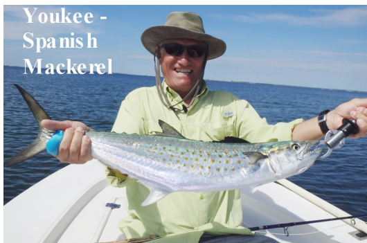
Youkee - Spanish Mackerel