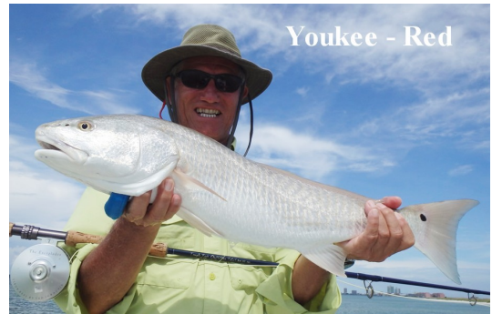
Youkee - Red

The sad thing is that since September 3 the redfish have had "lockjaw". We've had a lot of follows but no takes. I've tried everything I can think of including swimming along the flats in mask and snorkel looking for something... anything ...the redfish might be eating. The only fly I've been able to interest them in has been a popper. Hopefully it'll all turn back on as the water cools.