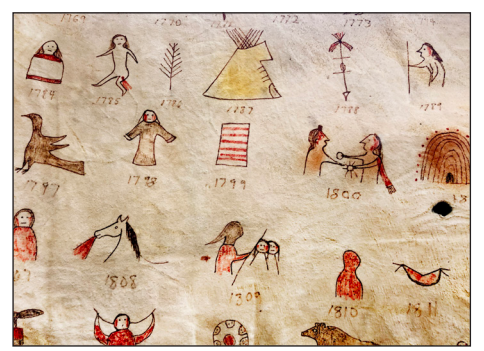
This detail of the winter count in our Arrival on the Prairie Gallery comes from the Cheyenne River Sioux Nation. Drawn on elk hide, it depicts events from 1769 to 1860. Each pictograph, recorded in winter, marks the past year with a single event.

But 2022 was also filled with dozens of other important and exciting projects. We've compiled them – primarily in chronological order – to