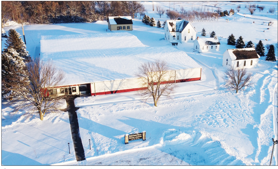
Our museum complex in January 2023; the photo was taken by Jeremy Waltner.

help document the life and times of our community's museum.