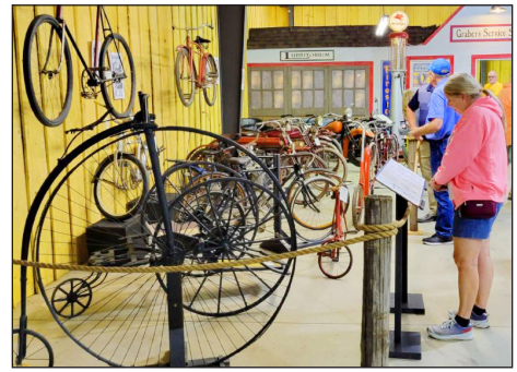
A special exhibit featuring vintage bicycles opened in the Unruh-Tieszen Wing in June.

9. Madeline also helped us set up Square, a new point-of-sale system that we're using for admissions, mercantile sales and inventory management. This improves our efficiency and customer service.