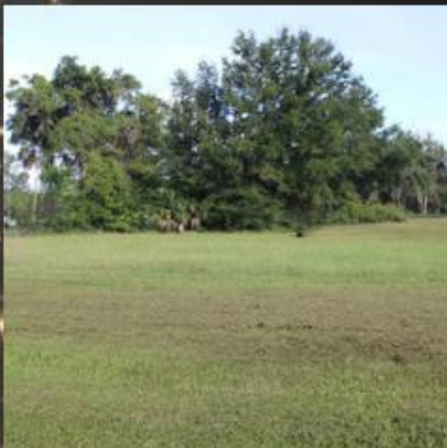
SEVERE SLOPING ON SE QUADRANT

Utilizing preservation-sensitive engineering methods allows for structural reinforcement without disturbing historic integrity. Elevation-appropriate grading, permeable surfaces, and non-invasive stabilization techniques help protect sacred spaces while addressing soil and water challenges.