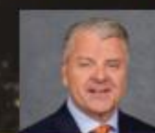
STATE REP JJ GROW