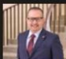
SENATOR RALPH MASSULLO