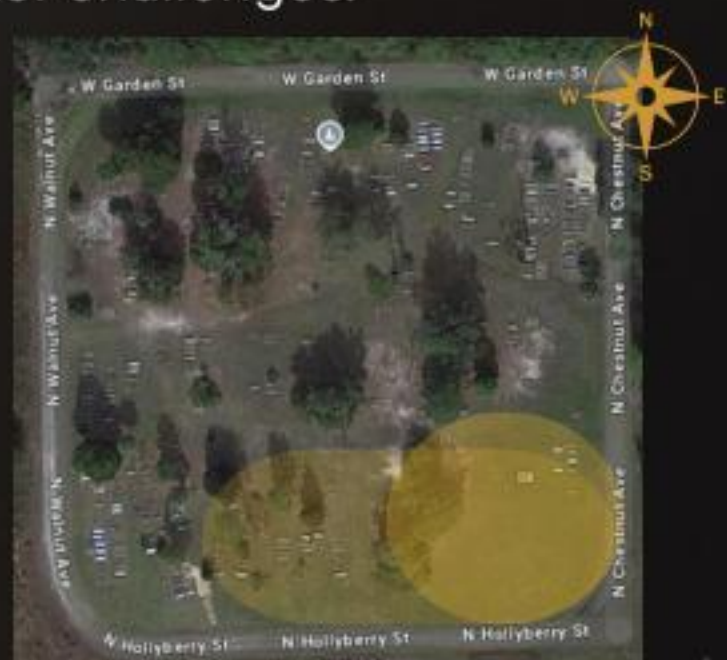
WATER RETENTION AREAS