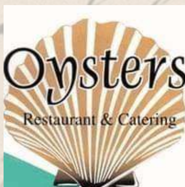
Oysters Restaurant (352)795-2633