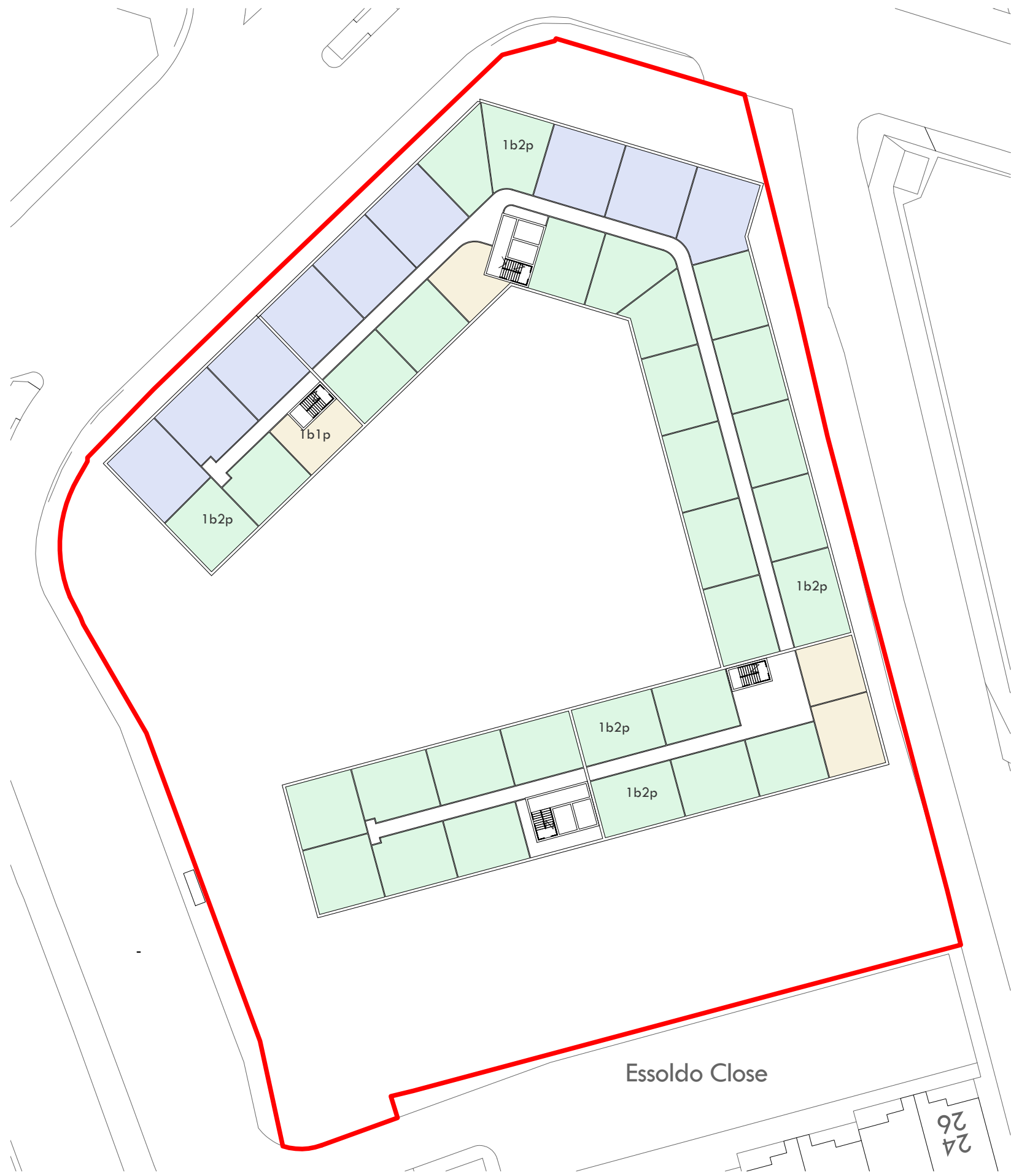
proposed site layout plan