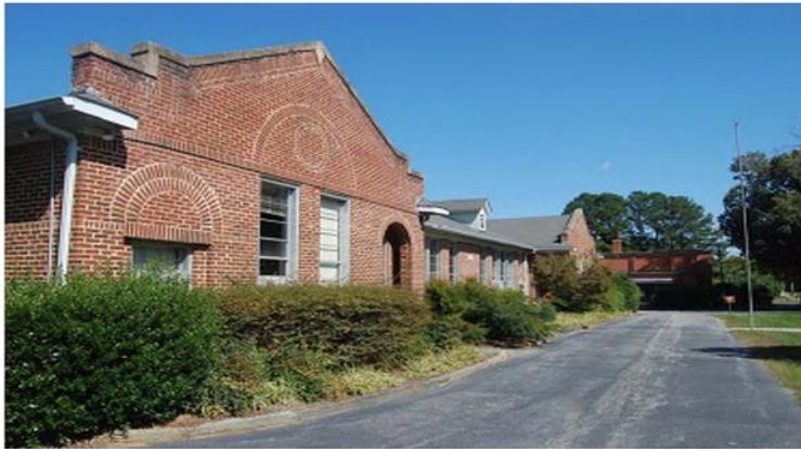
Plate 286. Mount Auburn School, Façade, Looking East Along Drive towards Gymnasium.

At FLEC, our core values of honesty, compassion, inclusivity, excellence, collaboration, and integrity form the foundation of our mission. These values aren't just words; they guide our every step and resonate through our impact.