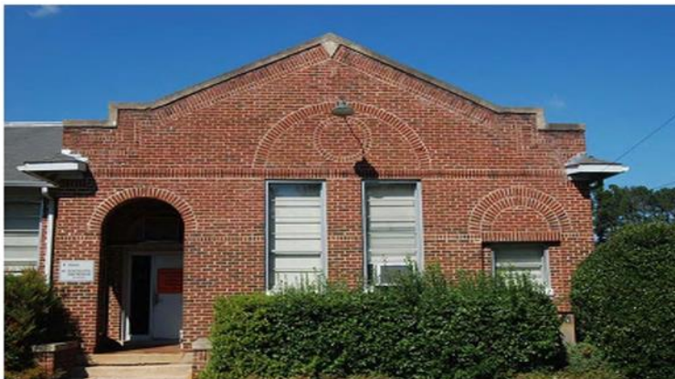
Plate 287. Mount Auburn School, Façade, Detail of East Entrance, Looking North.