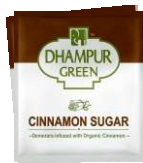
Cinnamon Sugar Sachets