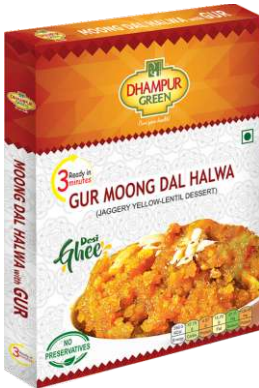
Gur Moong Dal Halwa