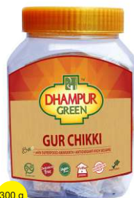
Gur Chikki (Assorted Varieties)