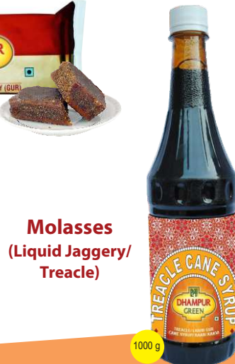
Molasses (Liquid Jaggery/ Treacle)