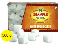
White Sugar SugarCubes