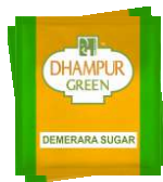
Demerara Sugar Sachets