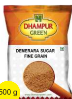
Demerara Sugar (Fine Grain)