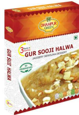
Gur Suji Halwa