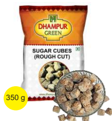
Brown Rough Cut SugarCubes