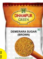
Demerara Sugar (Brown)