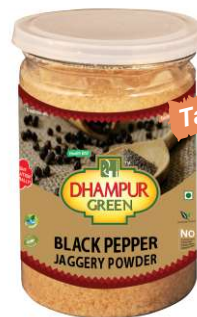
Black Pepper Jaggery Powder