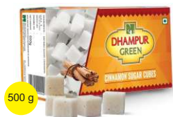
Cinnamon Sugar SugarCubes

Being an innovation driven company, we offer innovation in sugar cubes as well. Our customers have many options to choose from!