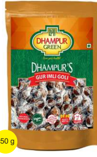
Gur Imli Goli