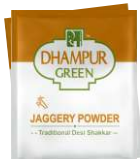
Jaggery Powder Sachets