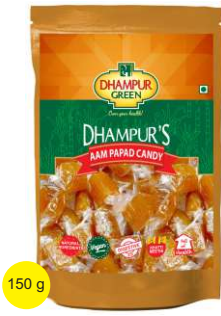
Aam Papad Candy