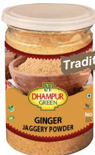
Ginger Jaggery Powder