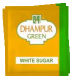
White Sugar Sachets