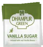
Vanilla Sugar Sachets

We also personalise sachets for you. Sweeten a conference or other get-together for your customers with sugar sachets or sticks printed with your logo, slogan and/or Web address.