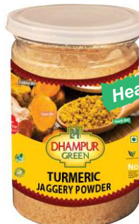
Turmeric Jaggery Powder