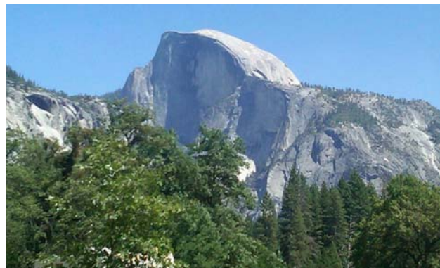
Half Dome, Yosemite National Park