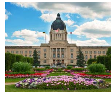
Legislative Building Regina, Saskatchewan

This morning our motorcoach takes us from Calgary, traveling through Alberta and Saskatchewan on Canadian Highway #1. Late this afternoon in Moose Jaw, Saskatchewan, a short narrated trolley ride will explain the murals throughout the town and reveal the stories of the early 1900 gangsters. Our overnight stay will be at the Comfort Inn & Suites of Moose Jaw.