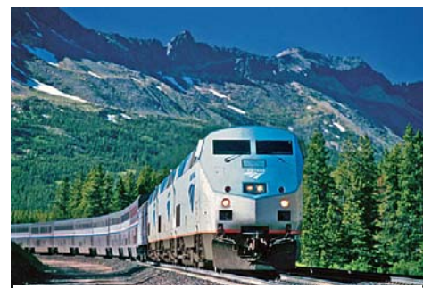
Amtrak through the Colorado Rockies!

All Aboard the Amtrak! After breakfast we'll travel through the Colorado Rockies, negotiating the "Big 10 Curve" and passing nearby Central City, once known as the "Richest Square Mile on Earth". Tracks can be seen far below as we wind between the Front Range of Denver and the Rockies while passing through 29 tunnels. Granby, the gateway city to Rocky Mountain National Park, leads us to the approximate