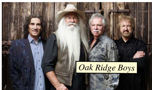
Oak Ridge Boys