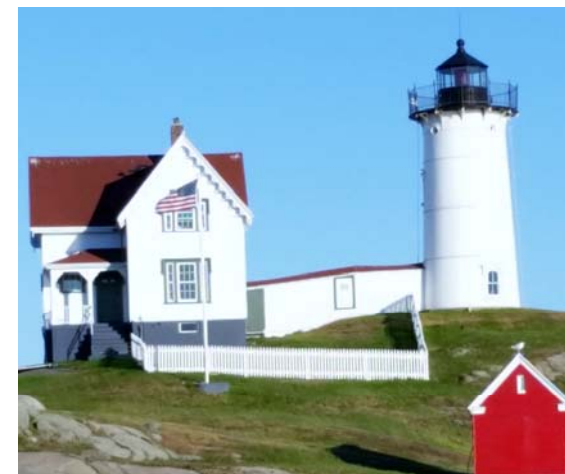
Nubble Lighthouse, Cape Neddick