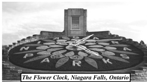
The Flower Clock, Niagara Falls, Ontario