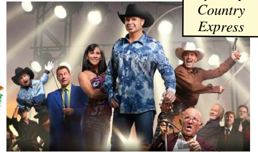
Clay Cooper Country Express