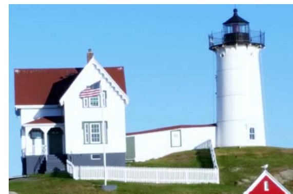
Nubble Lighthouse, Cape Neddick