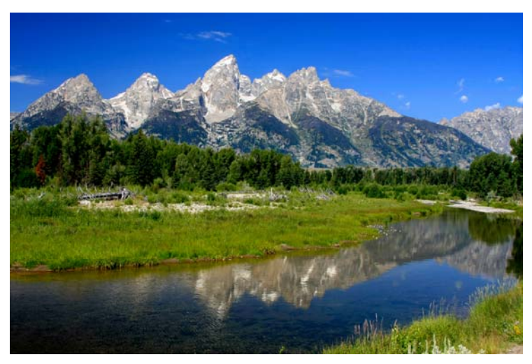
Grand Tetons - Jackson Hole, WY

After breakfast we will take a short jaunt to board the historic 1880 Train, pulled by a steam locomotive complete with vintage cars, and chug through the hills from Keystone to Hill City. For lunch we will visit historic downtown Rapid City where life-size bronze statues of our nation's past presidents line the sidewalks. Our afternoon will have great photo opportunities filled with an oasis of colorful blooms, lush vegetation, and nature as we stroll at our leisure through the botanical gardens and walkways of Reptile Gardens. Spectators can watch the show about snakes, alligators, and view the prairie dogs scurrying around in their little town. An early evening arrival at Mount Rushmore gives us an opportunity to see the museum, watch the production in the theater, visit the gift shop and eat a light meal. The illumination of the majestic 60-foot faces of four U. S. presidents gazing out over South Dakota's Black Hills continues to thrill visitors. As the sun sets and patriotic music plays, the sculpture is bathed in light.