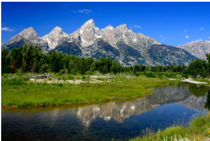
Grand Tetons - Jackson Hole, WY

After breakfast we will take a short jaunt to board the historic 1880 Train, pulled by a steam locomotive complete with vintage cars, and chug through the hills from Keystone to Hill City. For lunch we will visit historic downtown Rapid City where life-size bronze statues of our nation's past presidents line the sidewalks. Our afternoon will have great photo opportunities filled with an oasis of colorful blooms, lush vegetation, and nature as we stroll at our leisure through the botanical gardens and walkways of Reptile Gardens. Spectators can watch the show about snakes, alligators, and view the prairie dogs scurrying around in their little town. An early evening arrival at Mount Rushmore gives us an opportunity to see the museum, watch the production in the theater, visit the gift shop and eat a light meal. The illumination of the majestic 60-foot faces of four U. S. presidents gazing out over South Dakota's Black Hills continues to thrill visitors. As the sun sets and patriotic music plays, the sculpture is bathed in light.