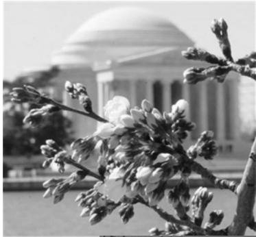
Our Nation's Capitol enclosed by the beautiful cherry blossoms