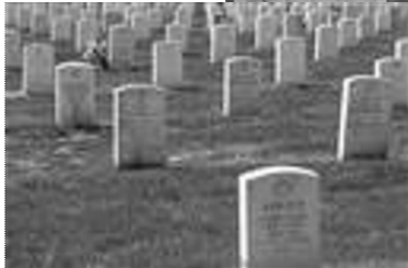
Arlington National Cemetery