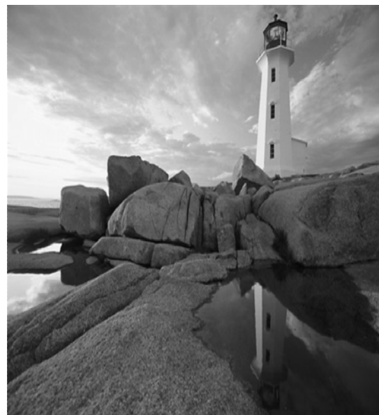
Peggy's Cove Lighthouse, Nova Scotia

August 29 - September 10, 2022 $2,848 per person