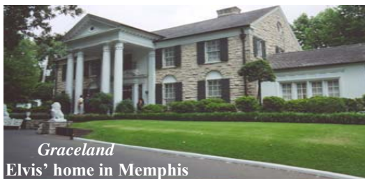
Graceland Elvis' home in Memphis

Finalized route & pick-up locations determined by Wendinger Travel at time of invoicing.