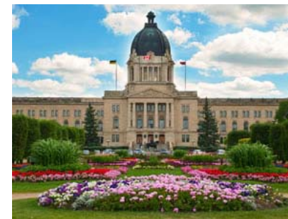
Legislative Building Regina, Saskatchewan

This morning, our motorcoach takes us from Calgary, traveling through Alberta and Saskatchewan on Canadian Highway #1. Late this afternoon in Moose Jaw, Saskatchewan, a short narrated trolley ride will explain the murals throughout the town and reveal the stories of the early 1900 gangsters. Our overnight stay will be at the Comfort Inn & Suites of Moose Jaw.