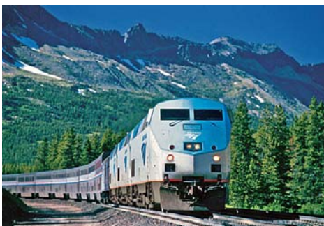
Amtrak through the Colorado Rockies!

All Aboard the Amtrak! After breakfast, we'll travel through the Colorado Rockies, negotiating the "Big 10 Curve" and passing nearby Central City, once known as the "Richest Square Mile on Earth". Tracks can be seen far below as we wind between the Front Range of Denver and the Rockies while passing through 29 tunnels. Granby, the gateway city to Rocky Mountain National Park, leads us to the approximate mid-point of the train's journey at Dostero; located at the base of Colorado's most recently active volcano, Dostero Crater. Spectacular