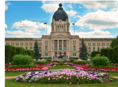
Legislative Building Regina, Saskatchewan

This morning, our motorcoach takes us from Calgary traveling through Alberta and Saskatchewan on Canadian Highway #1. Late this afternoon in Moose Jaw, Saskatchewan, a short narrated trolley ride will explain the murals throughout the town and reveal the stories of the early 1900 gangsters. Our overnight stay will be at the Comfort Inn & Suites of Moose Jaw.