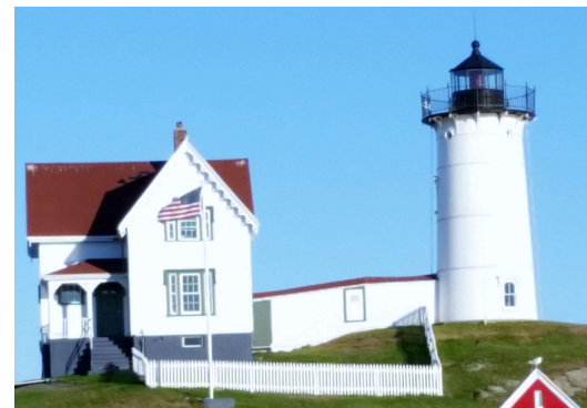
Nubble Lighthouse, Cape Neddick

Including Niagara Falls, New York City and Boston