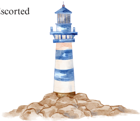
Split Rock Light House, Lake Superior, Duluth, MN