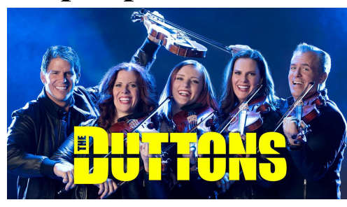
Day 1 - Monday, November 11