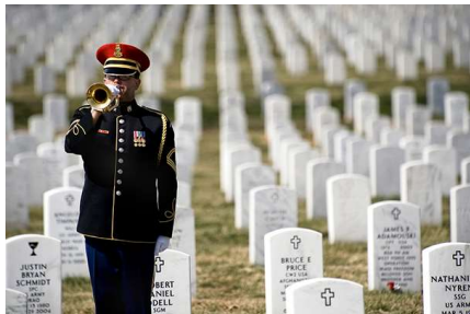
Arlington National Cemetery

Wendinger Travel P.O. Box 386 New Ulm, MN 56073 507-359-3111 info@wendingertravel.com www.WendingerTravel.com We planned it all, just give us a call!