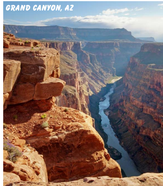
GRAND CANYON, AZ